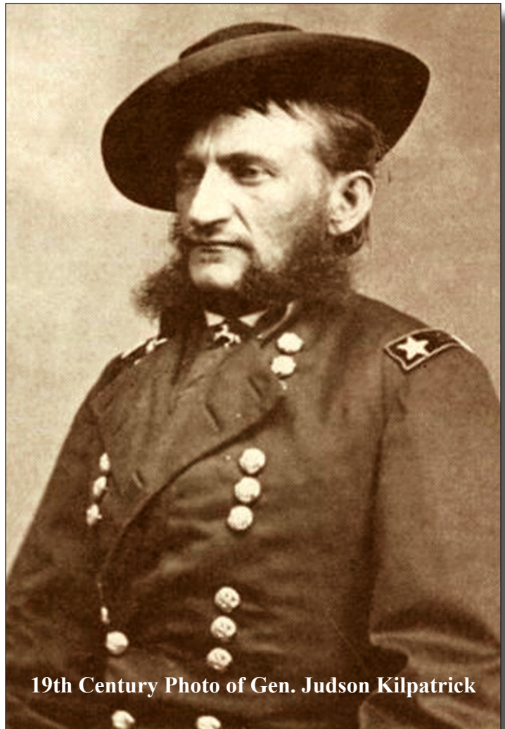
19th Century Photo of Gen. Judson Kilpatrick

“New Jersey and the Politics of the Civil War” is the first of a