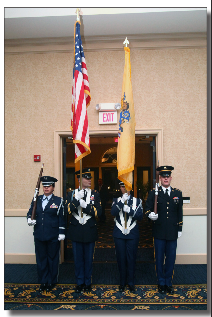
New Jersey National Guard's Honor Guards present the national and state colors at the NJNG's Joint Enlisted Professional Development Day at the Seaview, DOLCE Hotel & Resort in Galloway on Oct. 8.

Get Tax$ave Open Enrollment literature online at: www.state.nj.us/treasury/pensions/taxsave.shtml