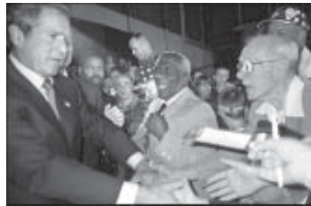
President George W.