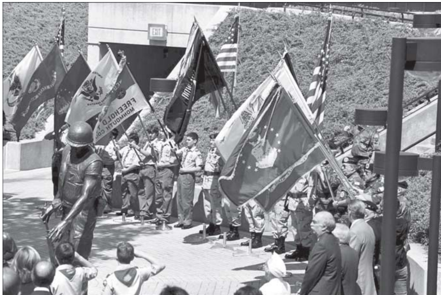
Chapter 800 of the Vietnam Veterans of America, the North Jersey Chapter of the 82nd Airborne Division Association, and Boy Scout Troop 155 of Freehold posted the colors at the Remembrance Day Ceremony.

It was announced that the New Jersey Vietnam Veterans' Memorial Foundation recently added three more names to the New Jersey Vietnam Veterans' Memo-