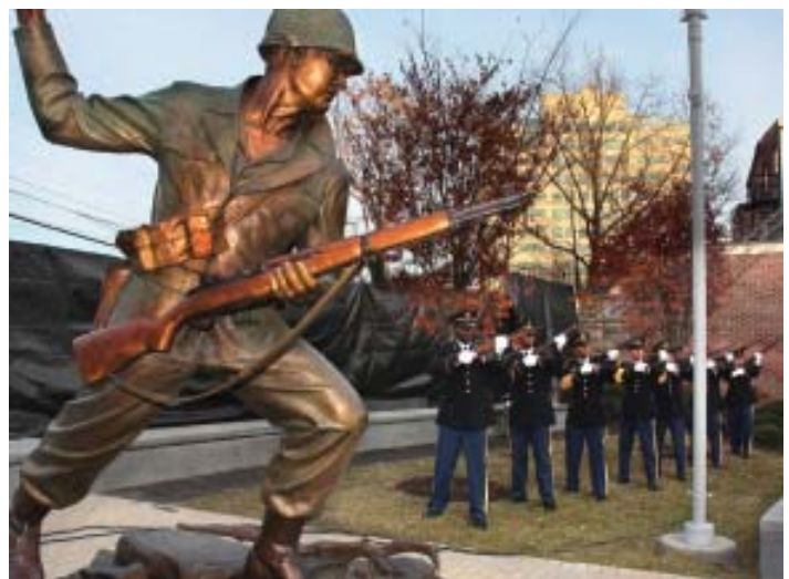
New Jersey Army National Guard Soldiers render a rifle salute.

The Memorial will serve as a fitting remembrance to honor the Greatest Generation and the New Jerseyans who made the ultimate sacrifice to save the world from tyranny.