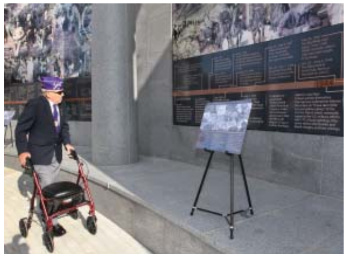
A veteran gazes on one of the four storyboard panels at the New Jersey World War II Memorial at Veterans Park.

The $7.6 million memorial is comprised of 3,000 pieces of