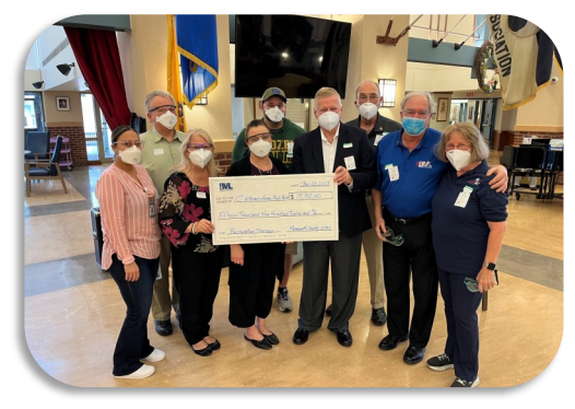
The Bowlers to Veterans Link (BVL) donated $15,912.00 to purchase a new Bingo machine and an Omnicycle for the Rehabilitation Gym

New Jersey Veterans Memorial Home at Menlo Park, 132 Evergreen Road , Edison, NJ 08818 732-452-4100