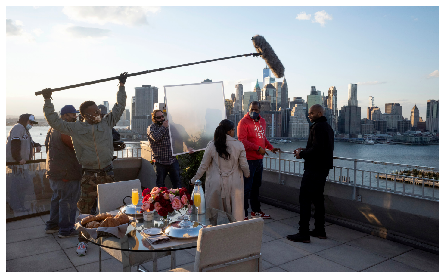
Filming for the Universal Television limited-series "The Best Man: The Final Chapters", based on the successful Malcom Lee film of the same name, took place throughout northern New Jersey.

Area in Harrison, Fairleigh Dickinson University, Montclair State University, NJPAC, Military Park in Newark, on the Hoboken waterfront and at a mansion in Saddle River.