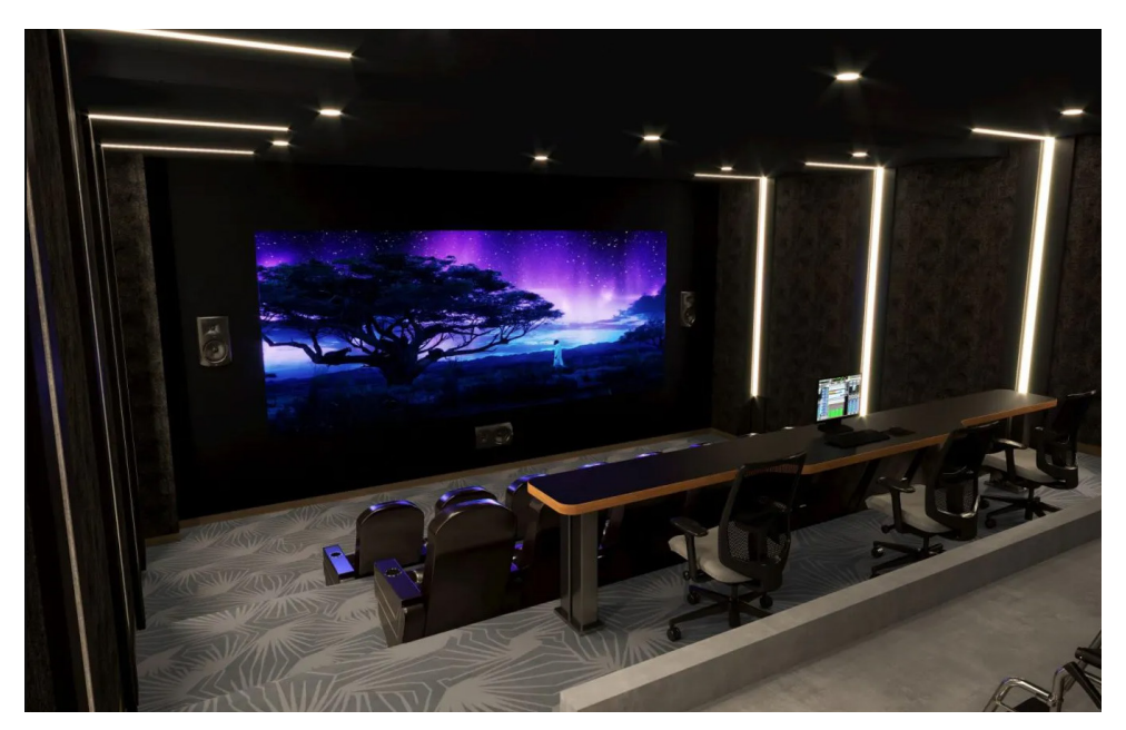
Screening Room at Phiphen Studio in Englewood Cliffs.

Skyrocketing demand for the use of New Jersey's varied locations has created the twofold challenge of