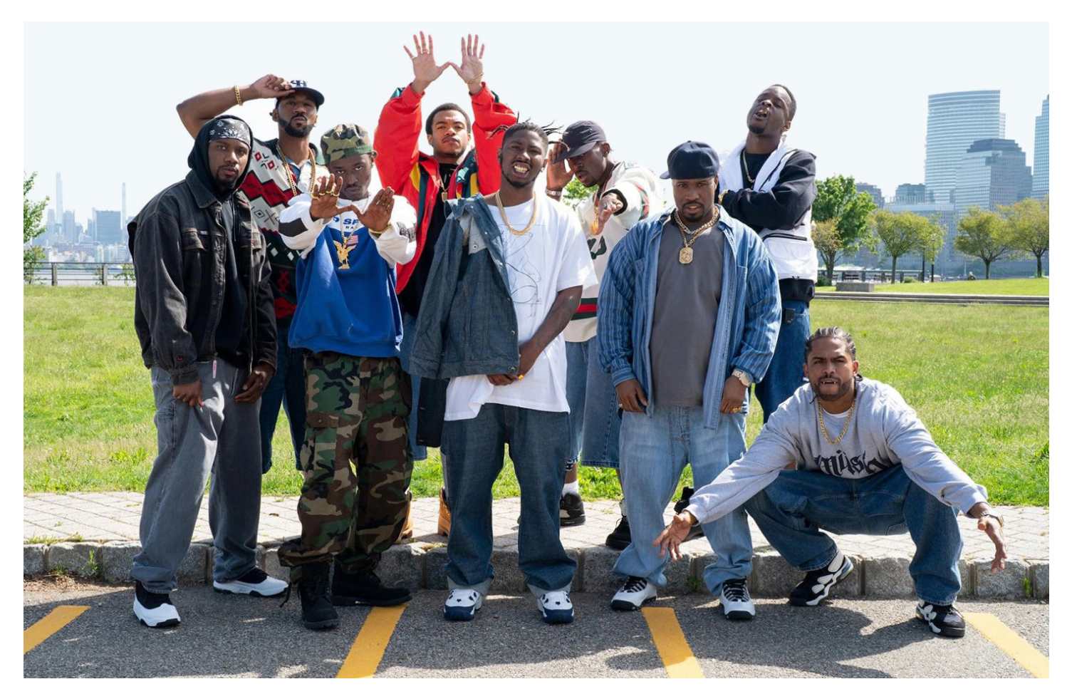
"Wu Tang: An American Saga", a Hulu television series, was filmed in Bergen, Hudson, Essesx, Monmouth and Ocean counties