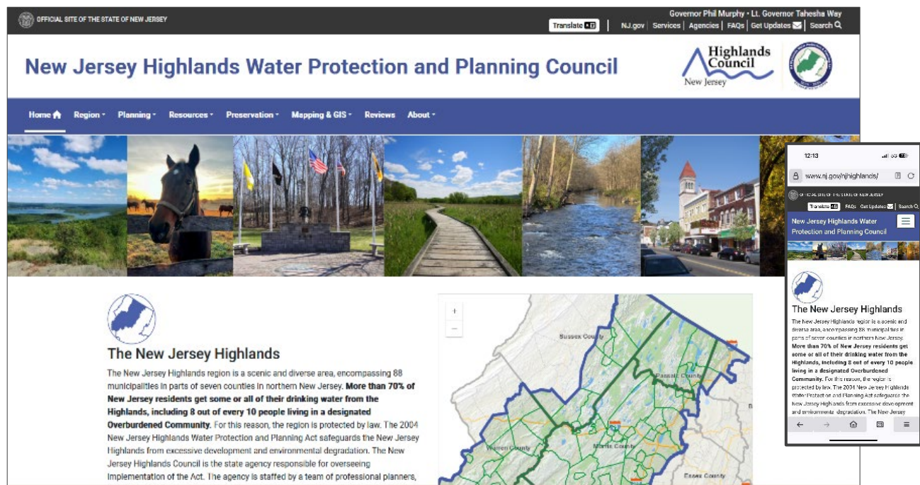
New Highlands Council Website: Desktop and mobile screen captures.