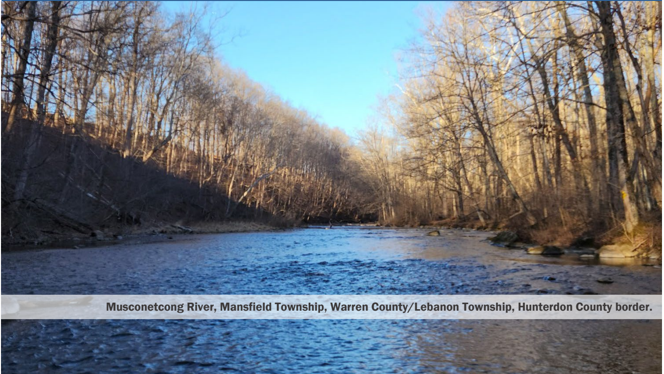
Musconetcong River, Mansfield Township, Warren County/Lebanon Township, Hunterdon County border.