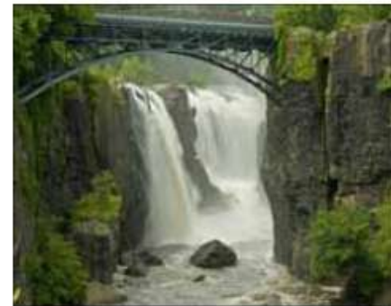
GREAT FALLS OF THE PASSAIC RIVER

Since 2001, the Open Space Trust Fund has amassed approxi-