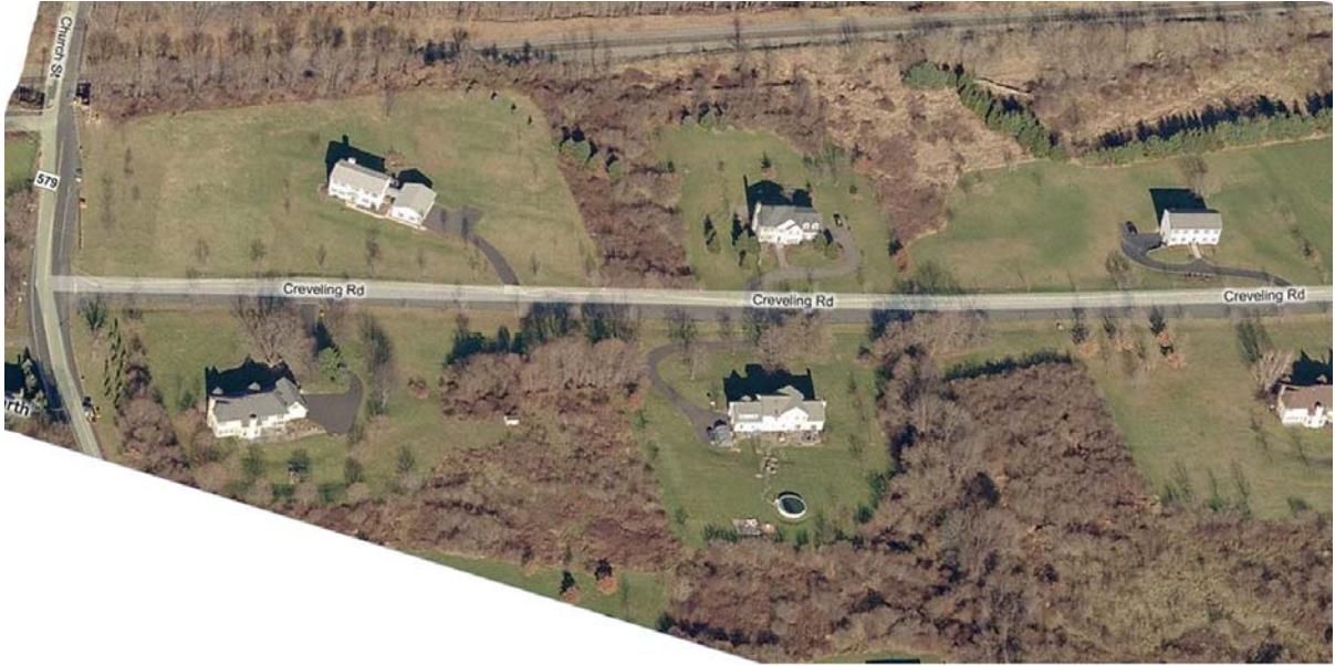
Bethlehem Township: Microsoft Oblique Angle Aerial Photograph, 2006