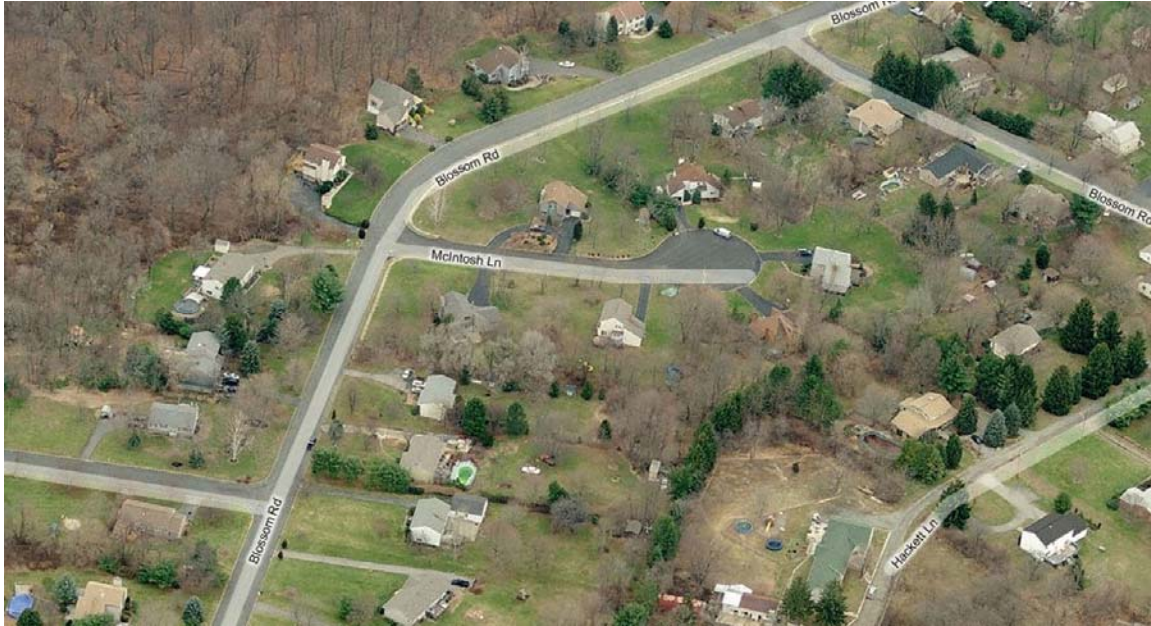
Bethlehem Township: Microsoft Oblique Angle Aerial photograph, 2006