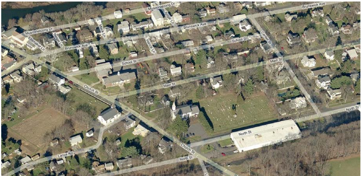
Microsoft Oblique Angle Aerial Photograph of Bloomsbury, 2006