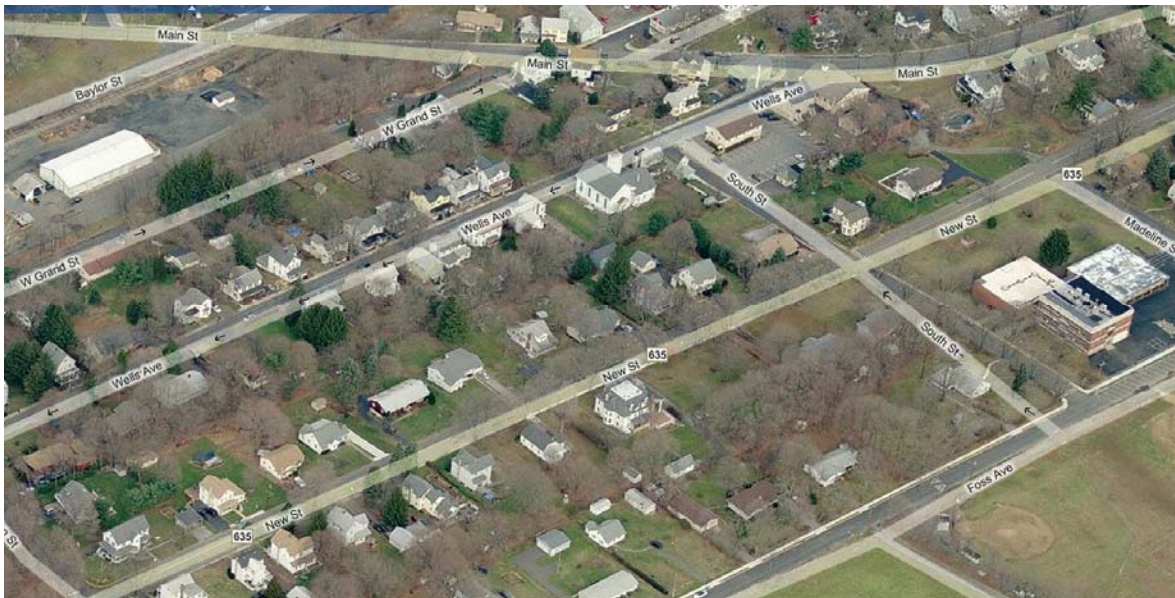
Hampton Borough: Microsoft Oblique Angle Aerial Photograph, 2006