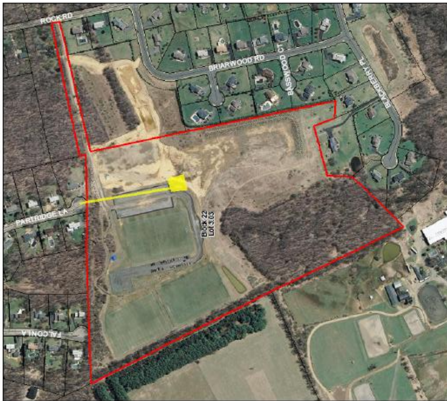
March 2011 Harrington Park Proposed Future Sewer Service Area Book 22, Lot 3.03 Washington Township Morris County, New Jersey Proposed Future Sewer Service Area Parcel Data Source: AECOM Morris County, Barlett Associates, Inc. B.A.M.I.C.H. CONSULTANTS Planning Dept.