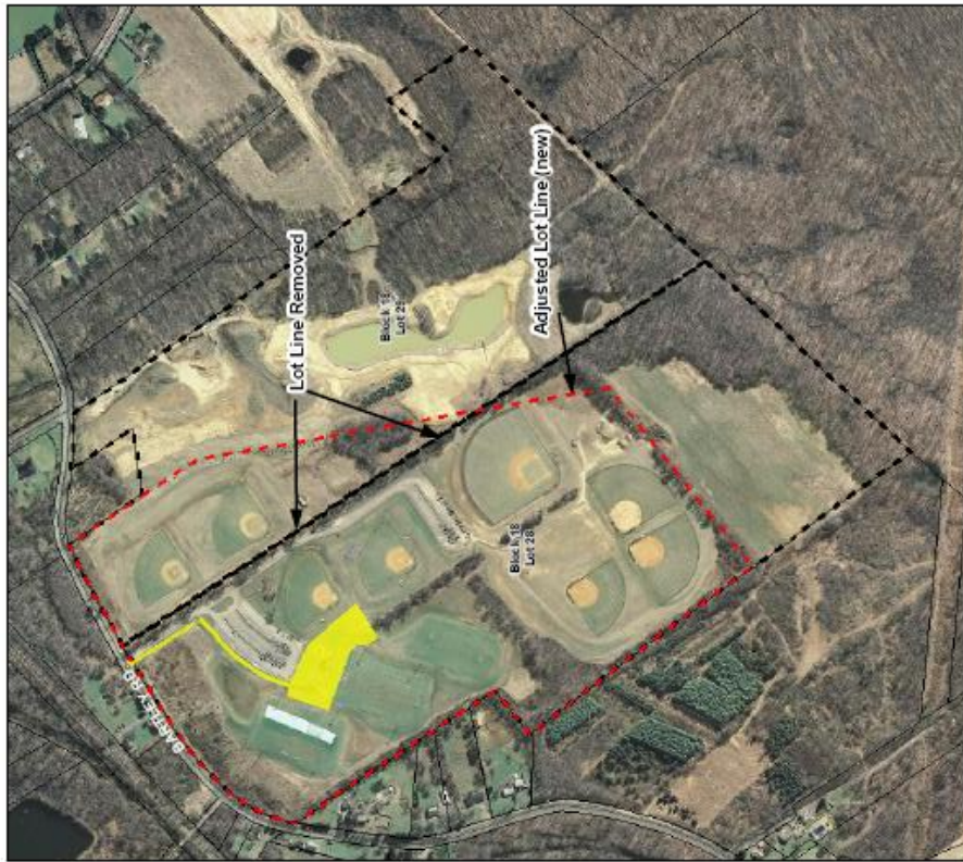
March 2011 Palmer Park Proposed Future Sewer Service Area Book 18, Lots 28 and 29 Washington Township Morris County, New Jersey Proposed Future Sewer Service Area Adjusted Palmer Park Lot Line Road Parcel Data Source: AECOM Morris County, Barlett Associates, Inc. B.A.M.I.C.H. CONSULTANTS Planning Dept.