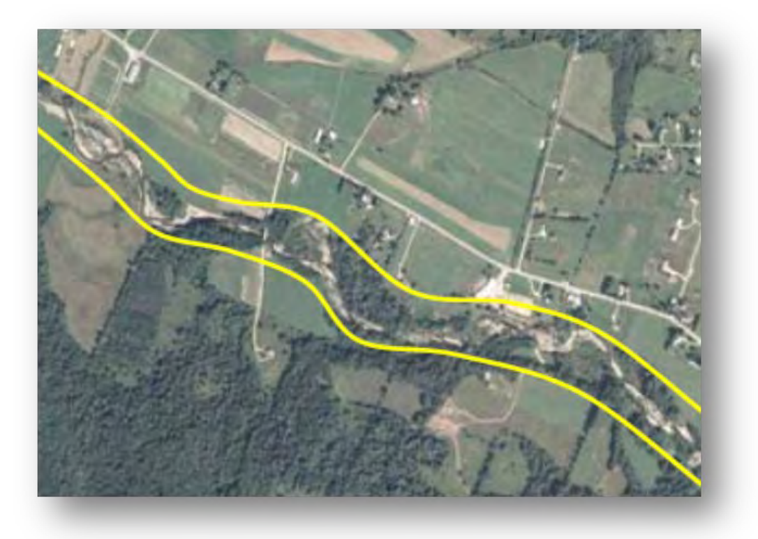
Figure 2: Meander Belt

While this represents a state of equilibrium, the river corridor remains dynamic and continues to evolve and will exhibit changes in channel alignment over time, particularly a lateral and downstream migration of the channel. While the channel may change location, it is stable in pattern, profile, and dimension because there is a balance in processes. For instance, bed erosion in a certain part of the channel is counteracted by depositional processes elsewhere under stable flow and sediment transport regimes such that channel dimensions, pattern, and profile will not change and access to the floodplain will be maintained. The continued movement of the channel also introduces the concept of the meander belt. The meander belt is the corridor in which the channel will naturally migrate back and forth over time to accommodate equilibrium conditions (Figure 2). The meander belt width is dependent upon various watershed features and stream type, but valley walls are primarily responsible for confinement. Man-made confinements like levees, elevated roadways and bridges, bank armoring, and other structures and developments in the meander belt can limit the natural channel migration processes and cause disequilibrium in the system.