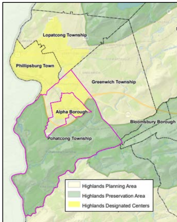
Figure 2. Existing Highlands Centers, Planning & Preservation Areas

Lopatcong and Pohatcong Townships are conforming Highlands municipalities located at the southernmost end of Warren County. The communities flank the eastern perimeter of the Town of Phillipsburg and, while adjacent to one another, share a border of just 3,600 feet or so in length. Lopatcong lies to the north, Pohatcong to the south. Each sought and received Highlands Council petition approval for Preservation and Planning Area lands, along with Highlands Center designations (shaded yellow in Figure 2, below) in the 2011-2012 timeframe. Lopatcong's Highlands Center includes 42% (1,539 acres) of its Planning Area lands, while Pohatcong's covers 52% (632 acres) of its.