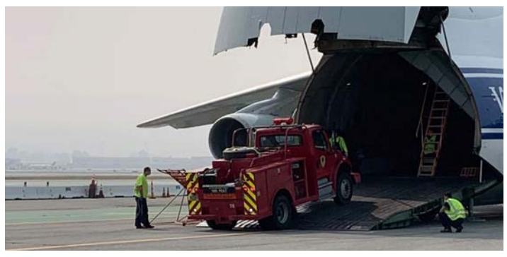
NJ fire engines arriving in California via airlift.

Ten Firefighters and several engines were deployed via airlift to California.