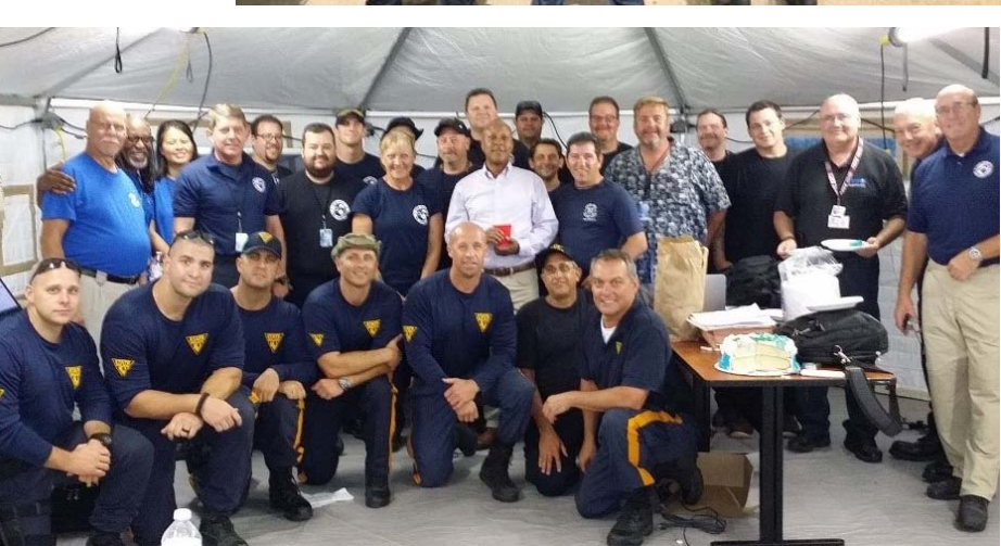
Members of the NJ EMS Task Force and NJSP/ NJOEM working together in the USVI