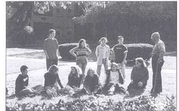
Members of Students Against Destructive Decisions (SADD) meet regularly throughout the state to discuss ways to combat underage drinking and driving.

Your Stomach - Alcohol can make a person sick to their stomach and cause ulcers.