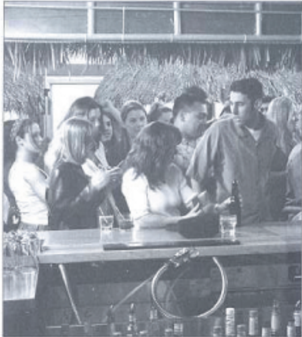
During "Undercover Operations", police officers pose as patrons or employees to help aid in the prevention of underage drinking.