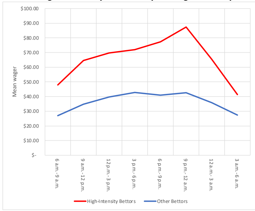
Figure 2. Mean Wager of Bets by Time of Day and High-Intensity Bettor Status

Figure 2 provides a visual representation of average wagers across time slots, which has implications for problem gambling. As demonstrated, not only do high-intensity bettors bet significantly more across all time slots but their average bets begin escalating around 3 p.m. and peak sharply at 9 p.m., making the window from 6 p.m. to 9 p.m. particularly lucrative for operators. This is not true of other bettors, whose betting appears to rise and fall from noon to midnight, corresponding with normal waking hours, and afternoon and "prime time" slots when most gambling traditionally occurs. The significance of this visual is that television advertising offering "free" and bonus money to players during the peak time period is likely to disproportionately impact high-intensity bettors, a continuing cause for concern.