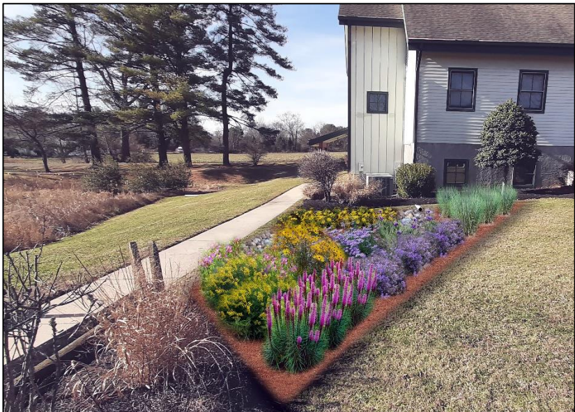
Above: The Rutgers Cooperative Extension sent the Commission an updated rendering to show the location and the native Pinelands plant species that will be incorporated into the 340-square-foot rain garden at the Commission’s headquarters.