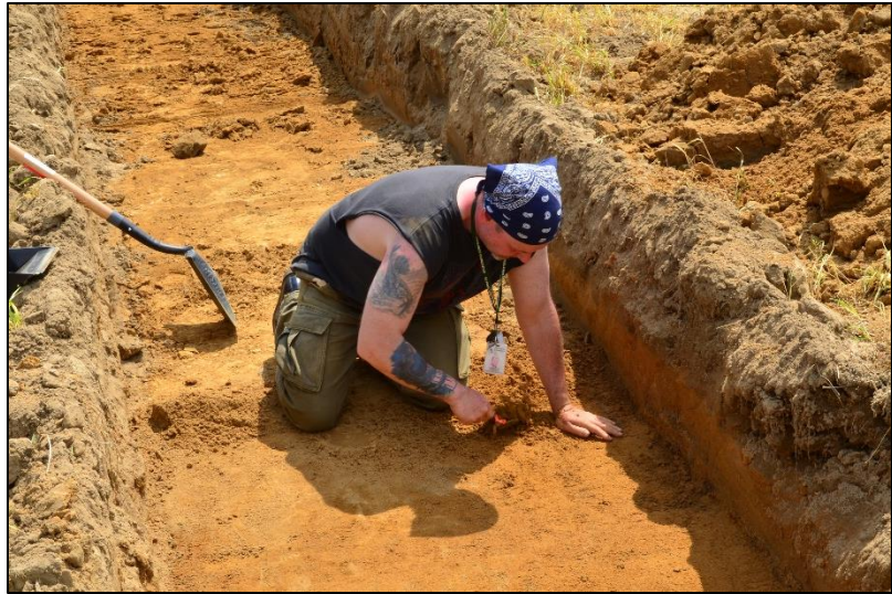
Above: A Commission archaeologist excavating the trench floor at the Brotherton site.