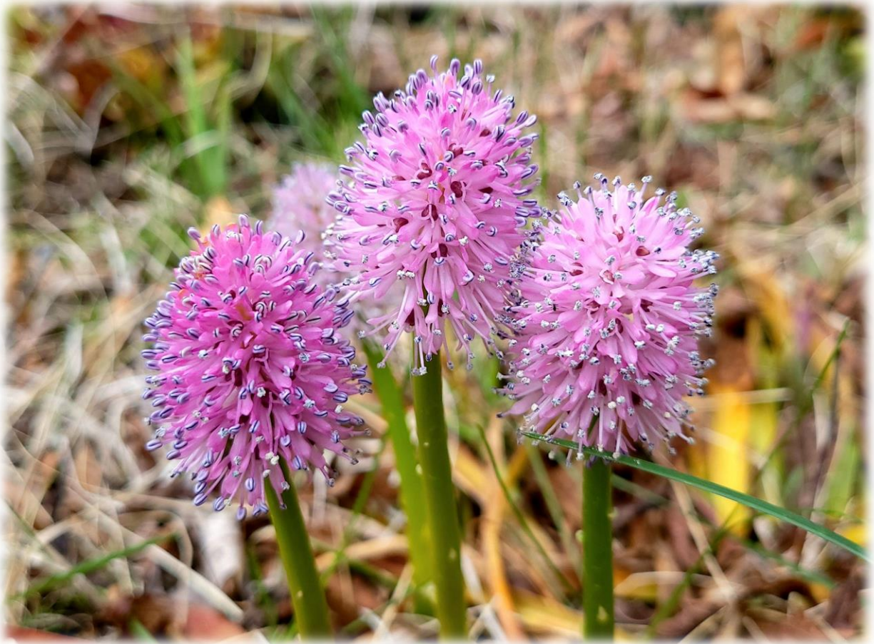
Native, state-endangered, globally rare swamp pink lilies blooming in April