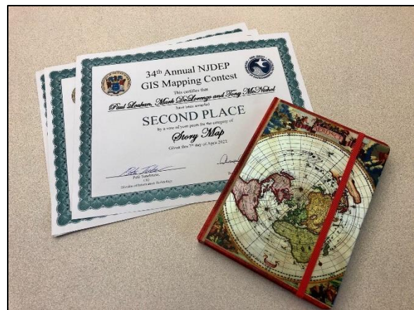
Above: The Commission won Second Place in a statewide mapping contest in April.