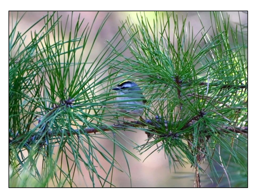
Above : The Commission shared 81 photos on Instagram in December, including this photo of a golden-crowned kinglet at the Black Run Preserve in the Pinelands.