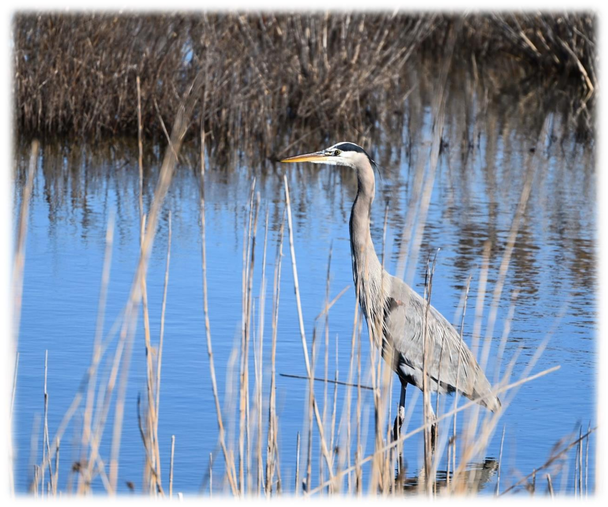
A great blue heron at the Edwin B. Forsythe National Wildlife Refuge in the Pinelands National Reserve in December