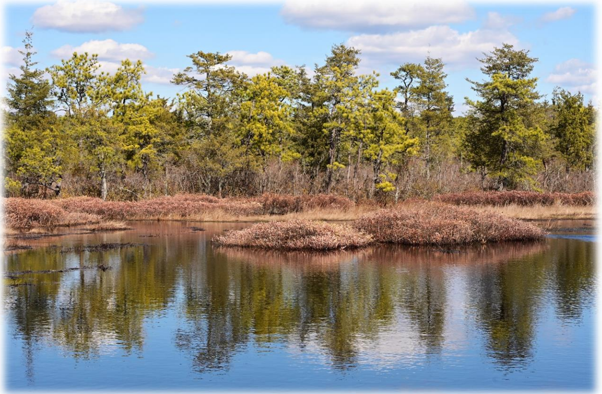
Reflections at Whitesbog Village, as photographed in February