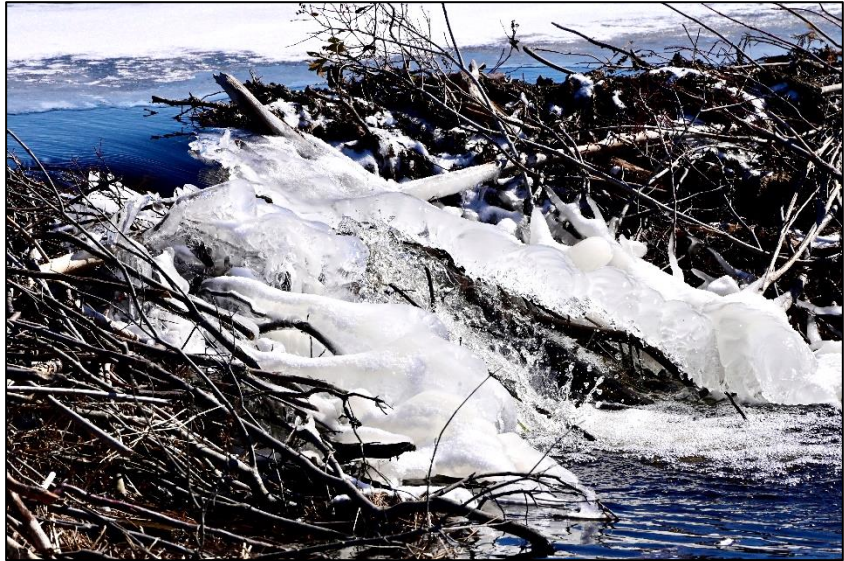
Above: Staff shared 216 photos on its Instagram site in February, including this photo of an icy beaver dam in the Pinelands.

Annual Report. The full Commission will consider a resolution to approve the final report during its regular meeting on March 14, 2025.