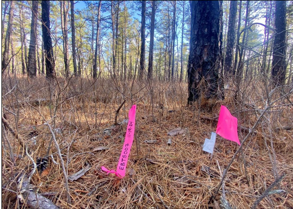
ABOVE: Temperature data loggers (ibuttons) were installed at box turtle brumation sites. The flag on the left marks the location of the turtle that is burrowed below the surface. The pin flag on the right supports two ibuttons; one located just below the flag for recording air temperature and one located beneath the surface for recording soil temperature.