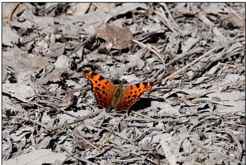
Above: Staff shared 60 tweets and retweets on its X site in March, including this photo of an eastern comma butterfly that was fluttering along a roadside in the Pinelands in March.