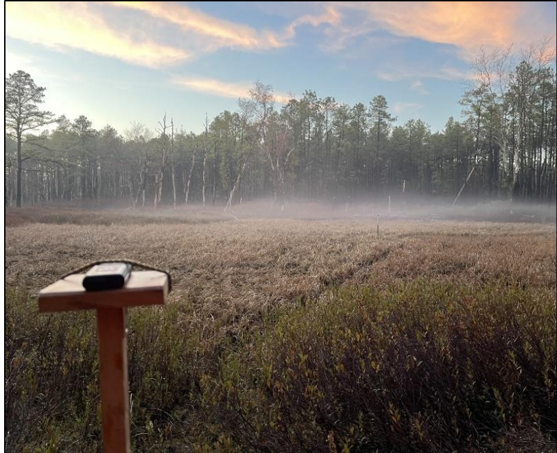
Above: This sedge dominated site is one of 22 ponds where frog and toad vocalization surveys are conducted. A digital recorder mounted on a post is readied to record vocalizations after sundown.