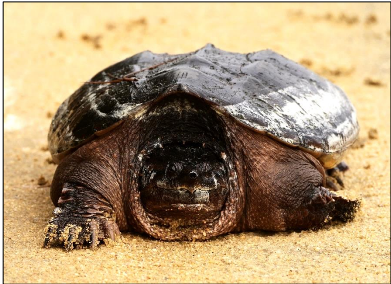
Above: Staff shared 232 photos on its Instagram site in March, including this photo of a native common snapping turtle that was walking along a trail in the Pinelands in March.