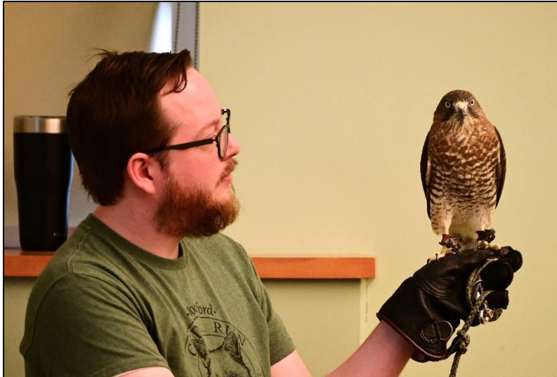
Above: Educators from the Woodford Cedar Run Wildlife Refuge delivered a presentation on the Raptors of the Pinelands during the 36 th annual Pinelands Short Course on March 8, 2025.