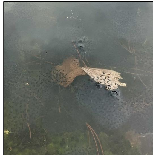
Above: Multiple clusters of wood frog eggs were discovered at this site during daytime surveys in March.