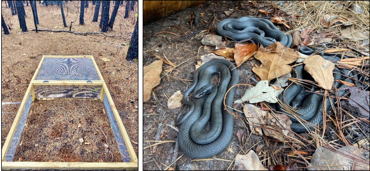
Above: In the photo on the left, a newly emerged corn snake is shown resting in a low-profile box corral. As shown in the photo on the right, black racers that were discovered resting under a cover board within a snake corral.