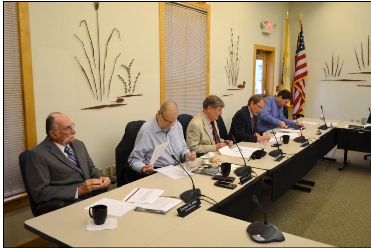
Above: The Commission's Policy & Implementation Committee met on November 22, 2019.