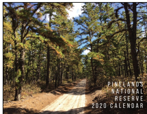
Above: The 2020 Pinelands wall calendar was distributed to the public in late November.