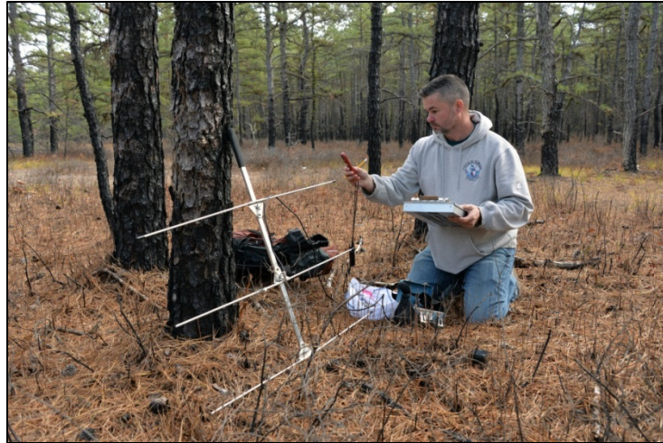
Above: A Commission Research Scientist collects data for a radio-tracked corn snake.

Number of individuals of each animal species found under wood or metal cover or in box traps placed along a drift fence in Wharton State Forest. An individual may have been caught more than one time.