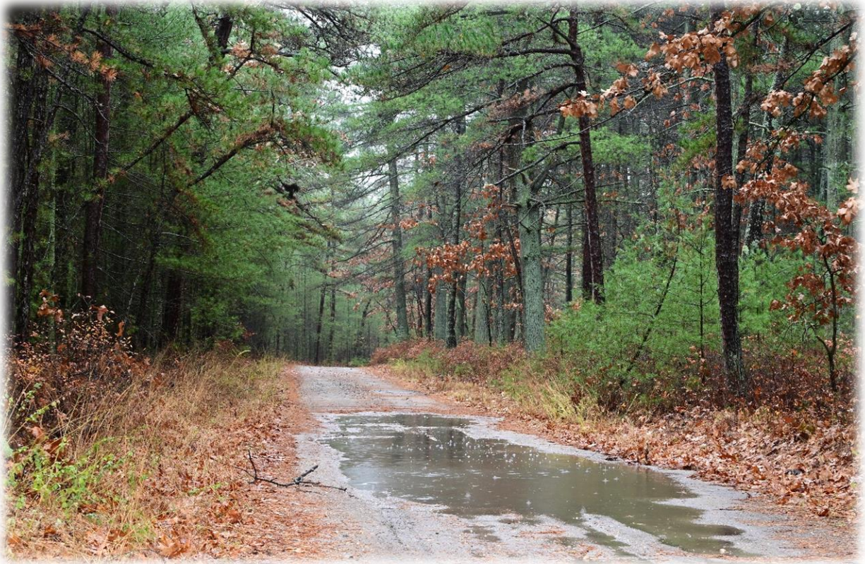
A much-needed rainstorm in Brendan T. Byrne State Forest in the Pinelands, as photographed in November