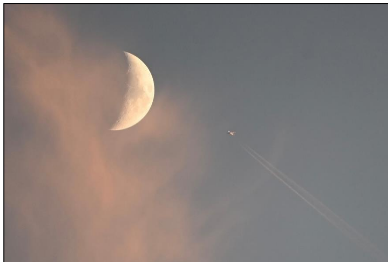
Above: Commission staff shared 124 photos on its Instagram account in November 2024, including this photo of a plane seemingly soaring toward the moon above Wharton State Forest in the Pinelands.