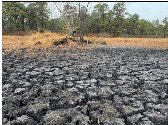
Above: The cracked and deeply fissured substrate at this long-term monitoring pond reflect many weeks of negligible rainfall.

For the second time this year, a long-term monitoring pond was damaged by an off-road vehicle. The vehicle was driven through the woods and into the pond, crushing wetland vegetation and destroying a