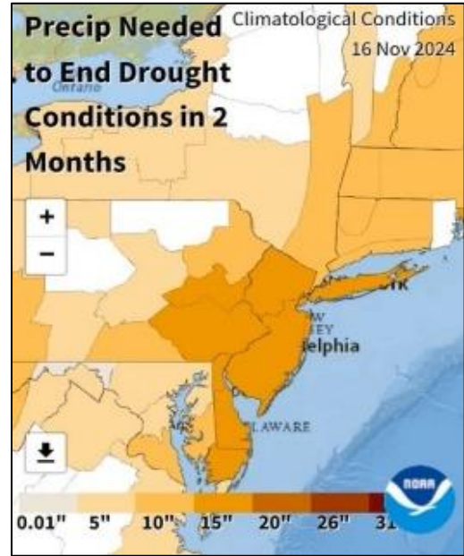
Above: Drought conditions in November worsened. This graphic indicates the amount of precipitation needed for the region to climb out of drought.