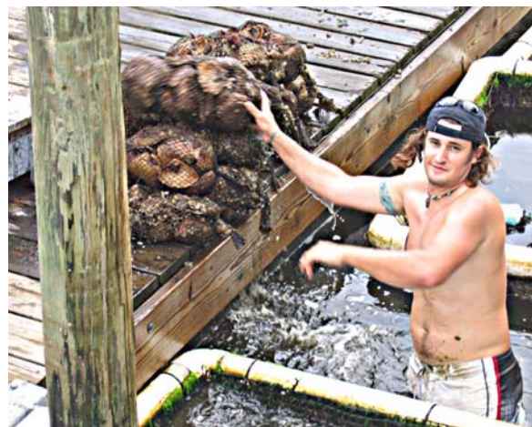
LEFT: Young oysters on clam shell substrate. RIGHT: A bayman loads bags of young oysters for a trip to the Navesink River oyster reef, where they will continue growing.