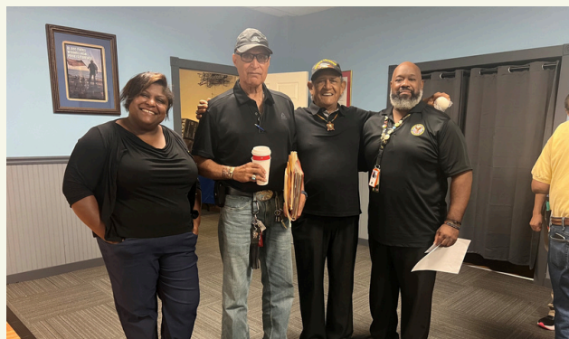
American Indian & Alaskan Native Veteran Talking Circle

Thanks to the support from our friends at the VA and the AI / AN Veteran Talking Circle, we are happy to announce a wealth of new information and resources for Native veterans! Navigate to the Government Resources tab on the Commission website and go to Veteran's Resources to learn more.