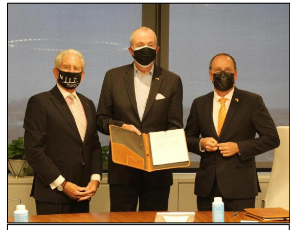
Signing of NJIT-BGU MOU

> Projects: Over the course of 2021 the Commission assisted with several significant projects including helping to major facilitate two academic agreements with economic impact on the state. The Commission supported the Choose New Jersey economic development delegation to Israel and established first contact ahead of the announcement by Sheba Medical Center to expand into New Jersey. The state also saw the arrival of Israel's largest aerospace company, Israel Aerospace which conducted Industries, demonstration at Atlantic City Airport.