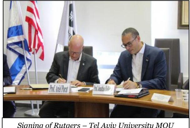
Signing of Rutgers - Tel Aviv University MOU