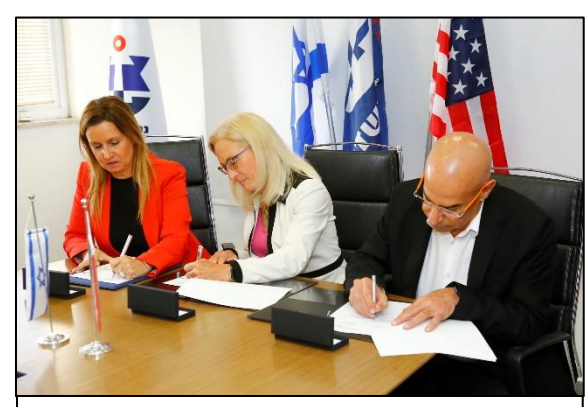
Signing of Port of Ashdod - NJCU MOU