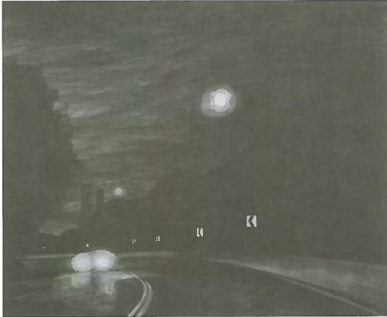
So Yoon Lym

Edgewater, 2008. Acrylic on paper, 14 inches x 17 inches