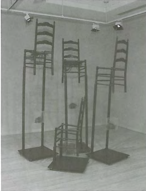
Michael Wiley Paradox, 2007, Mixed media 70 inches x 60 inches x 60 inches