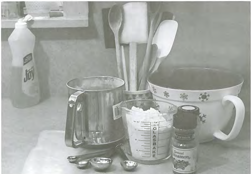
Jeanne V. Campbell

Touch the Sky, 2008. Enamel on canvas, 52 inches x 56 inches