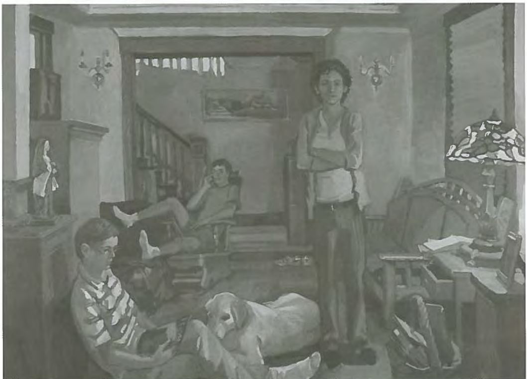
Daniel Finaldi At Night with Family, 2008. Oil (no surface medium given), 36 inches x 48 inches