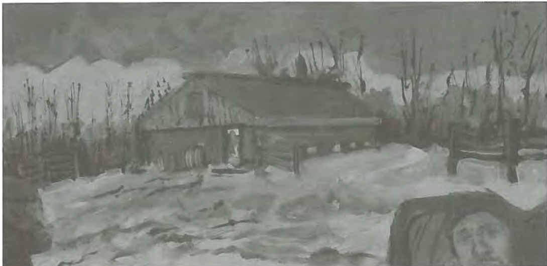
Seth Ruggles Hiler

Rear View Studio, 2008. Oil (no surface medium given), 12 inches x 24 inches