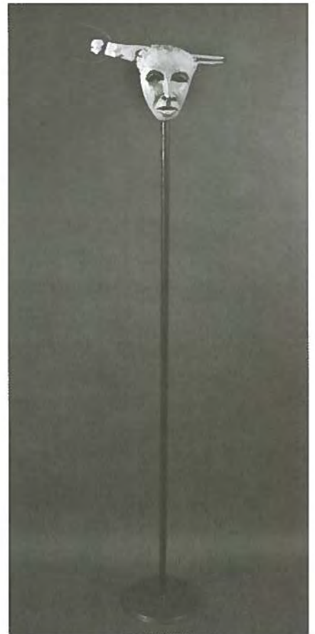
Susan H. Wilson I and Myself, 2008, Clay and mixed media 78 inches x 16 inches x 10 inches