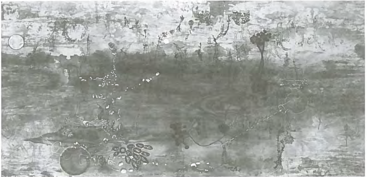
Tai Hwa Goh

Suspicious Seed 08-3, 2008. Mixed media print on hand waxed paper, 24 inches x 50 inches