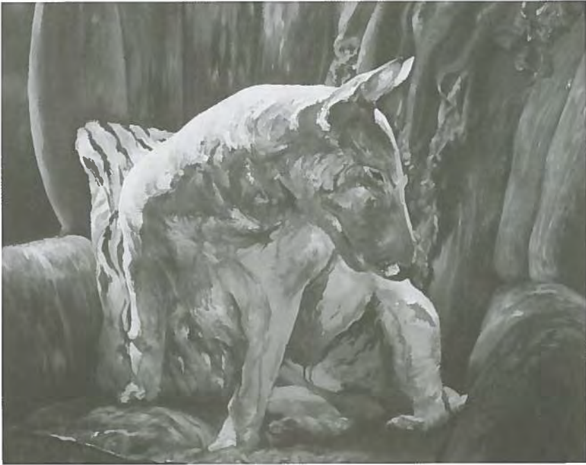
Alyssa Edmée Fanning Red Zero, 2007. Oil on linen, 26 inches x 33 inches