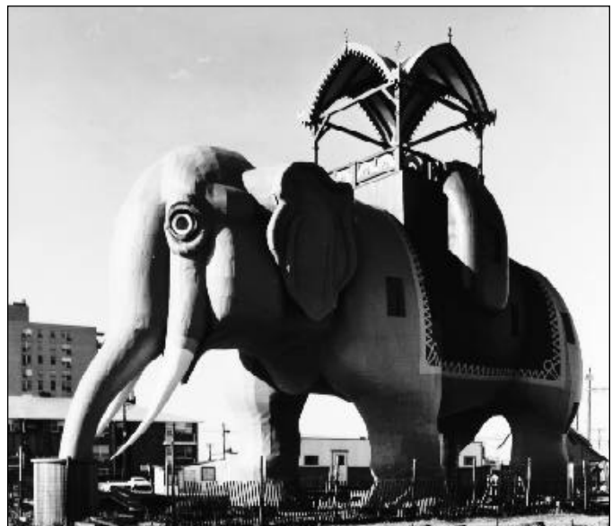
Lucy the Elephant, Margate, Atlantic County

For further information on the State Development and Redevelopment Plan or any of the tools to implement the Plan, such as Center Designation, contact the Office of State Planning.