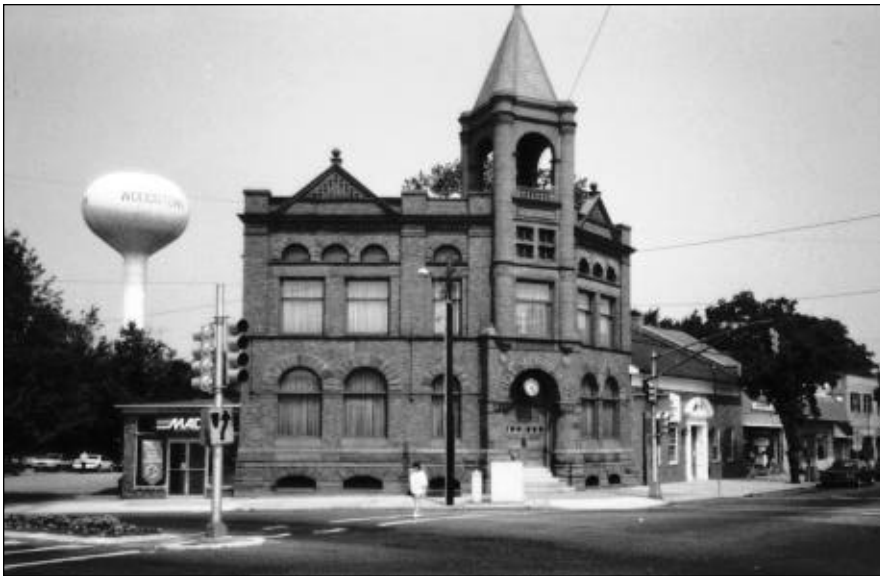
Old First National Bank (now, First Union Bank) c. 1895, Main Street and West Avenue, Woodstown, Salem County - Photo by: Matthew Gough

erties of national importance as National Historic Landmarks.