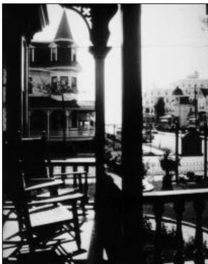
Cape May, Cape May County

To be eligible for the New Jersey and National Registers of Historic Places, a building, structure, object, site or district