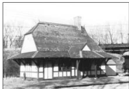
Great Meadows Railroad Station, Independence Township, Warren County

The vision of the State Plan encompasses the development of new communities that not only conserve today's cultural and natural resources, but will themselves become the subjects of preservation efforts in the next century.