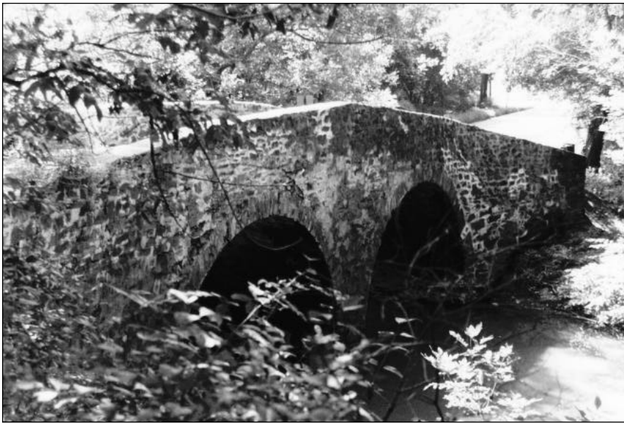
Opossum Road Bridge, Montgomery Township, Somerset County