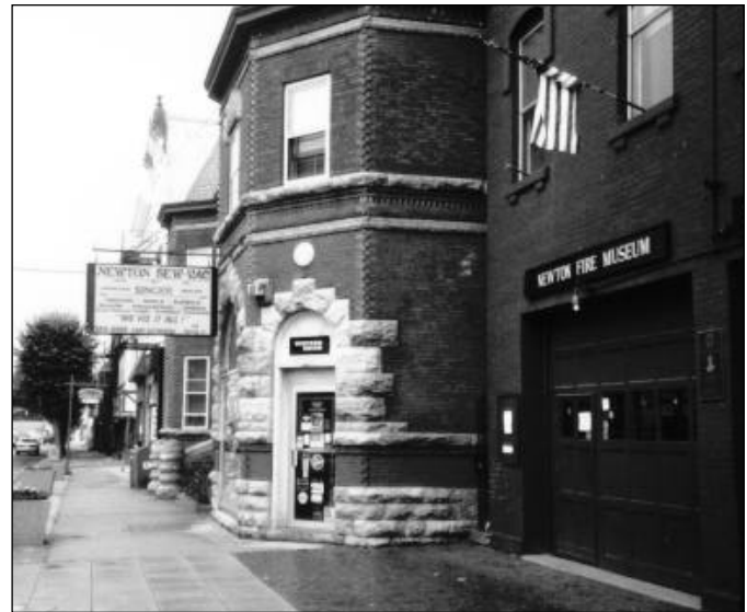
Spring Street, Newton, Sussex County

Plan we have learned that we must identify and protect historic resources not only because of their links to our past, but also because of their ability to shape our future. Historic preservation helps us identify the enduring and valuable, and provides a model for planners, developers and builders. By identifying the features of the built environment that we collectively value, we can use them to upgrade the quality of design today and to create the historic resources of tomorrow.