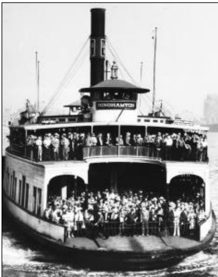
Binghamton Ferryboat, Edgewater, Bergen County Binghamton c. 1945 -1953