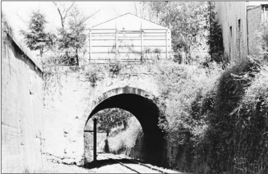
Railroad Underpass, Farnsworth Avenue, Bordentown, Burlington County

Municipalities with historic preservation commissions and State Plan center designation include: Camden, Hopewell Borough, Jersey City, Newark, Newton, Paterson, Trenton and Woodstown.