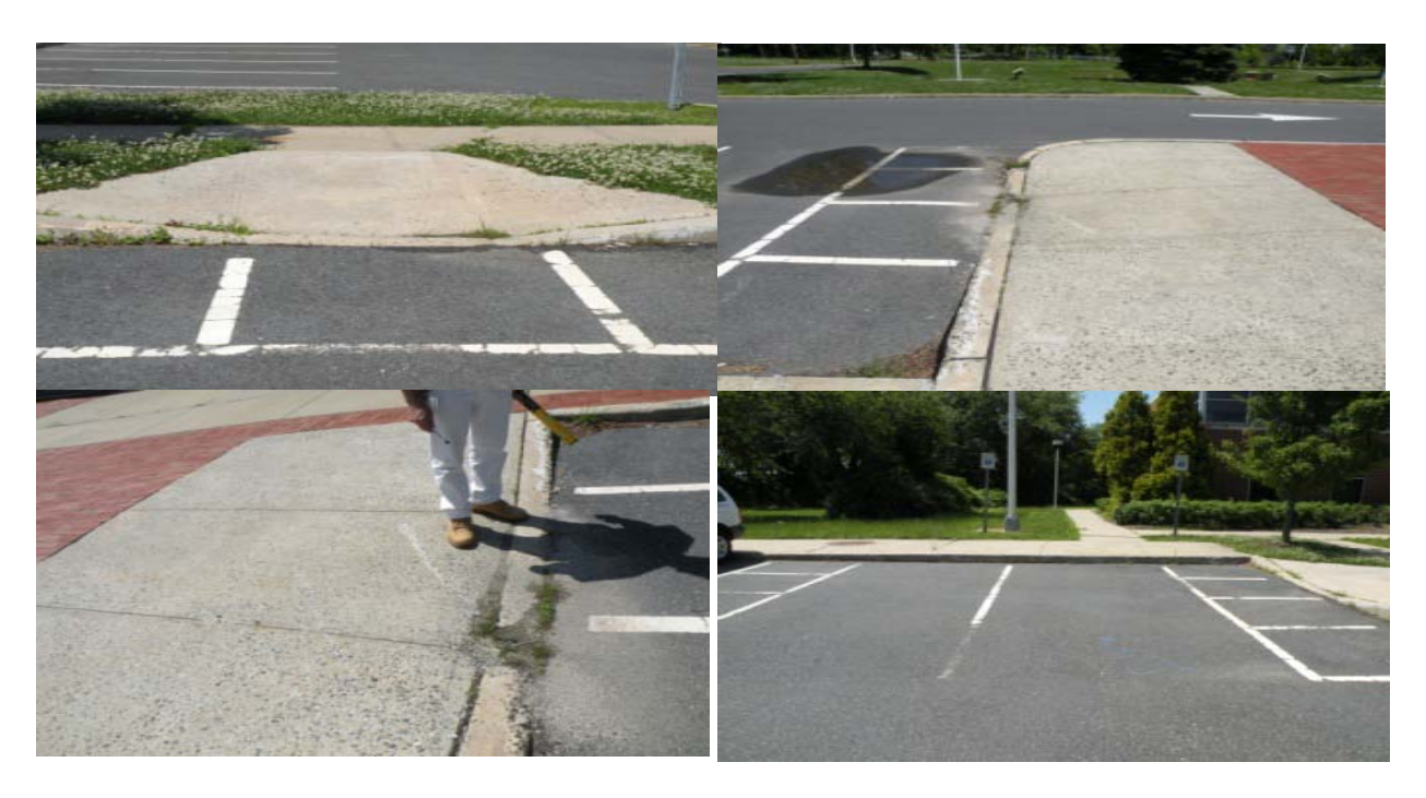
AFTER: Installed (4) new Curb Ramps (9/13/10) and (4)Truncated Domes 9/20/10