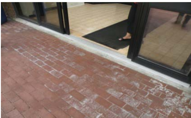
AFTER: On 8/28/10 the bricks were reinstalled to be made flush with the threshold edge.