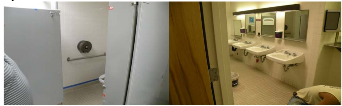
AFTER: Accessibility Signs mounted on rest room walls and side of doors. Pictograms with raised characters below pictogram symbol were installed on 9/9/10.