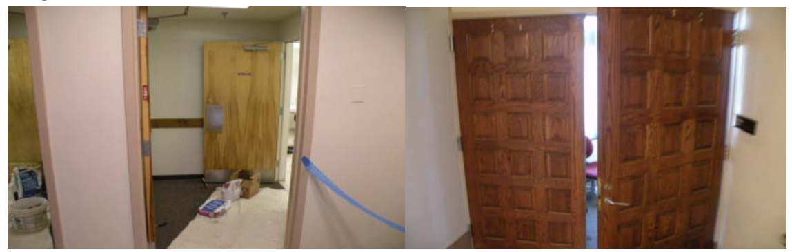
AFTER: Signs installed that have raised letters, Grade II Braille, and that meet all other requirements for permanent room or space signage. Work completed 9/9/10.