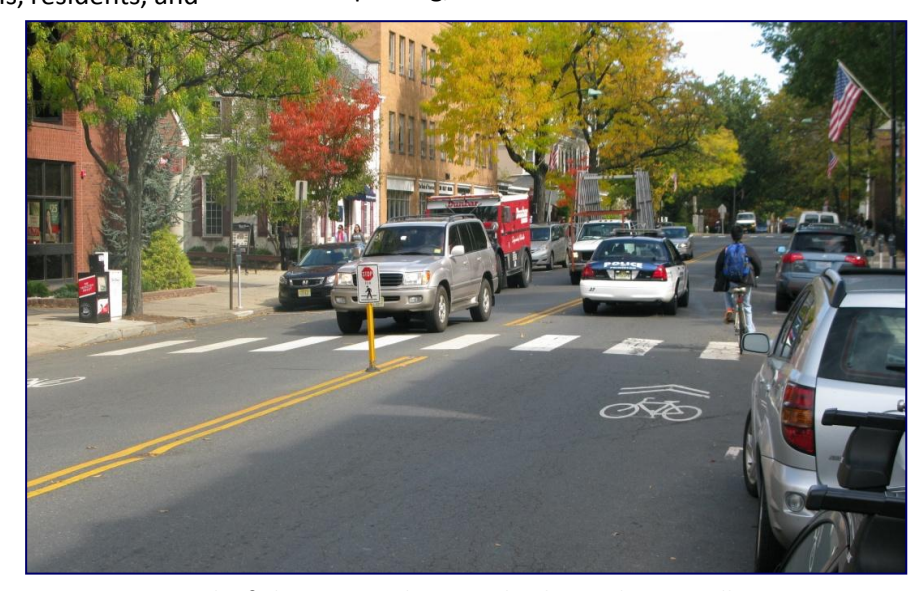
A network of Sharrow markings and enhanced crosswalks is recapturing Princeton's streets and creating a multimodal network that truly meets the goal of Complete Streets: serving all users and all modes on all streets.

The Borough and Township of Princeton implemented a network of bicycle Sharrows in the summer of 2011 to improve mobility and safety through the downtown core. Since many roadways in the downtown core are low-speed, narrow, and often include on-street parking, Sharrows were identified as an ideal