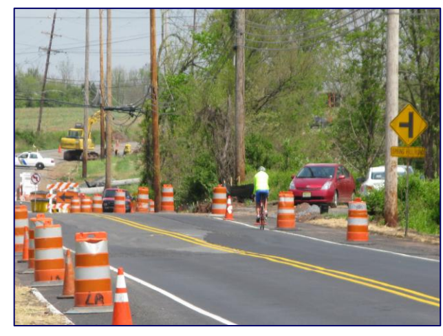
This rural arterial highway under construction in Somerset County incorporates Complete Streets elements and sustainable stormwater management.

The Department's own policies, procedures, and programs can serve as examples for how municipal and county government can adopt similar procedures and ensure that Complete Streets principles are considered throughout the project life cycle.