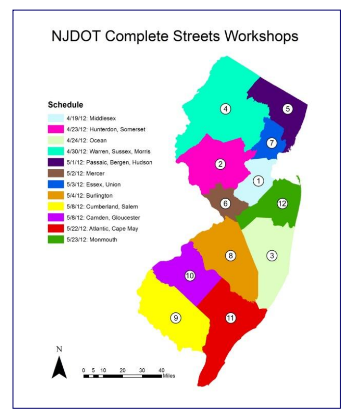
NJDOT Complete Streets Workshop Locations

policies and improvements throughout the state. Over 300 elected officials, decision makers, and professionals from New Jersey municipalities and counties attended these workshops in April and May of 2012.