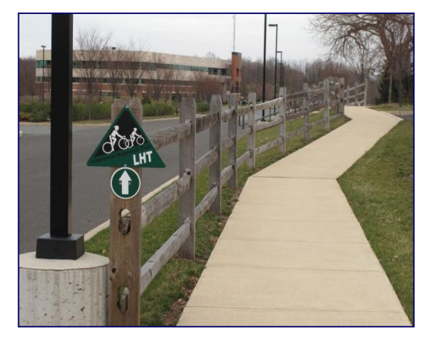
A public-private partnership is building the Lawrence Hopewell Trail in Mercer County, NJ

boundaries. Similarly, partnerships between local governments, counties, and NJDOT can help to achieve consistent design treatments for roads operated by different levels of government, including multimodal treatments for intersections involving more than one jurisdiction.