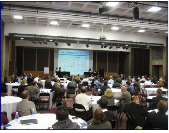
2010 Complete Streets Summit, New Brunswick, NJ

A statewide Complete Streets Summit was held in 2010 with a steering committee of local and state agencies, advocacy groups, Transportation Management Associations, citizens, and other stakeholders. Nearly 200 local, county, regional, and state agency planners, engineers, citizens, and officials attended the Summit.