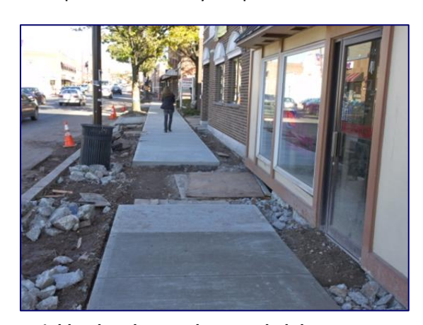
Highland Park recently upgraded the streetscape of the Route 27 commercial area, repairing sidewalks, installing street trees and furniture, and creating rain gardens, to improve safety, access, aesthetics, and sustainability.

The City of Linwood used its Complete Streets policy to encourage a developer to make the Cornerstone Commercial property accessible to bicyclists and pedestrians, with linkages to surrounding facilities.<sup>(4)</sup>