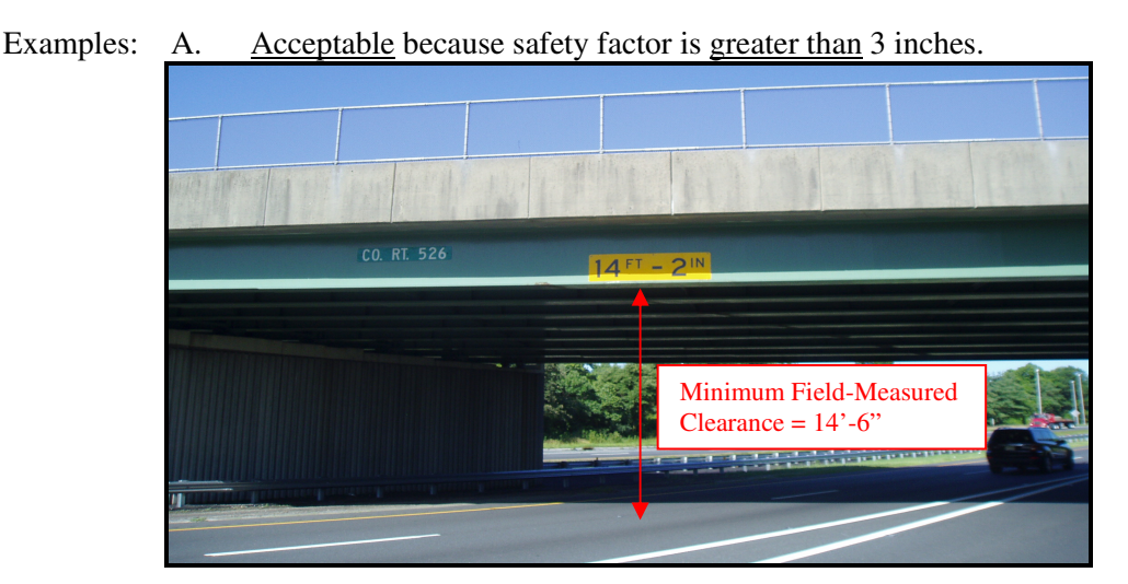
Page 2 of 3

If an inspection team determines that a safety factor of at least 3 inches is not implemented on a posted structure, the team must issue a Priority I Memorandum to have the structure reposted.