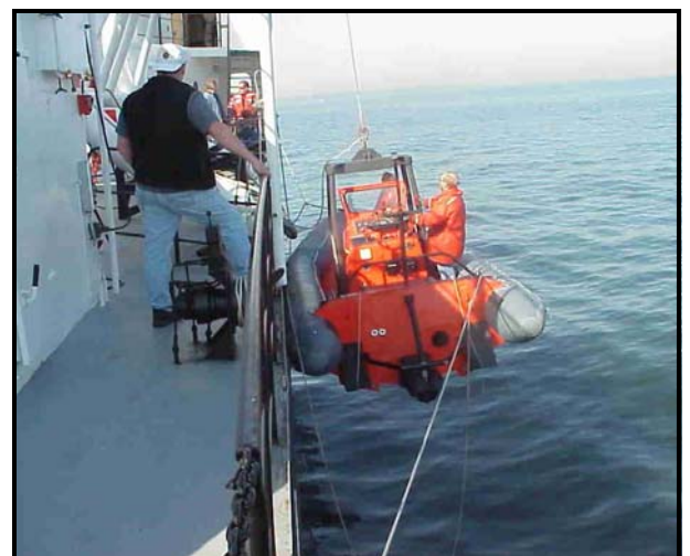
Once a vessel is safely guided out of the port a RIB is often used to lower the Maritime Pilot to the awaiting pilot boat.