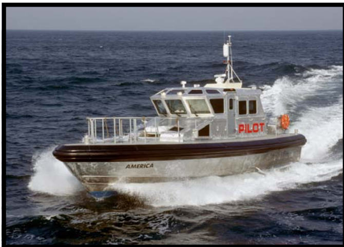
The Pilot Boat America .