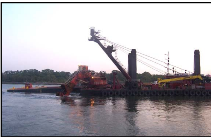
The Dredge New York, owned and operated by Great Lakes Dredge and Docking Company works on the Arthur Kill deepening project.

ing the stability of the PVSC outfall tunnel situated below the project area. Over the past year, the State of New Jersey and the project management team have been surveying and monitoring the conditions in and around the tunnel in order to design a way to dredge the channel without jeopardizing its integrity. This work is expected to result in a final design by April of 2007. In the meantime, a contract will be let soon to dredge the channel area outside of the footprint of the outfall tunnel. It is anticipated that work will begin in June of 2007 and run through the end of 2008.