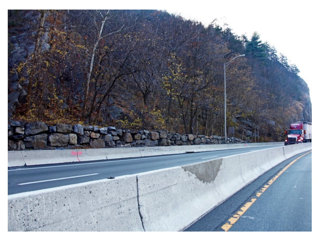
Photograph 2: Area B, looking southeast.