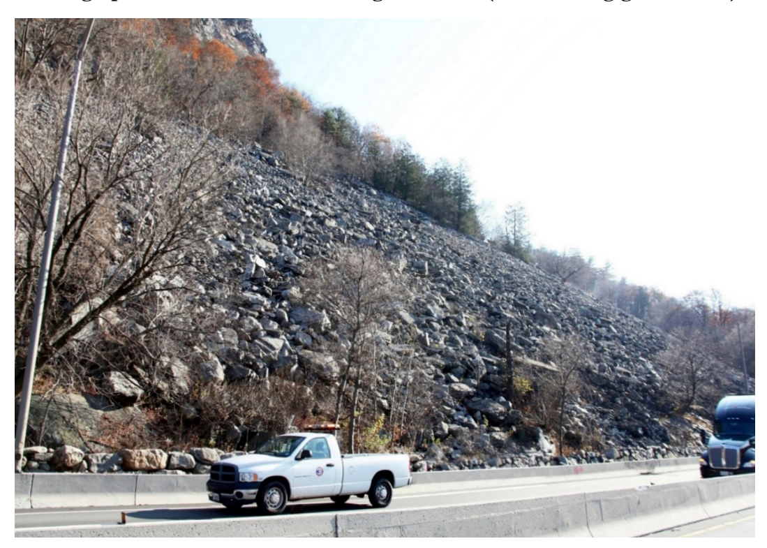
Photograph 4: Area D, looking east at talus slope.