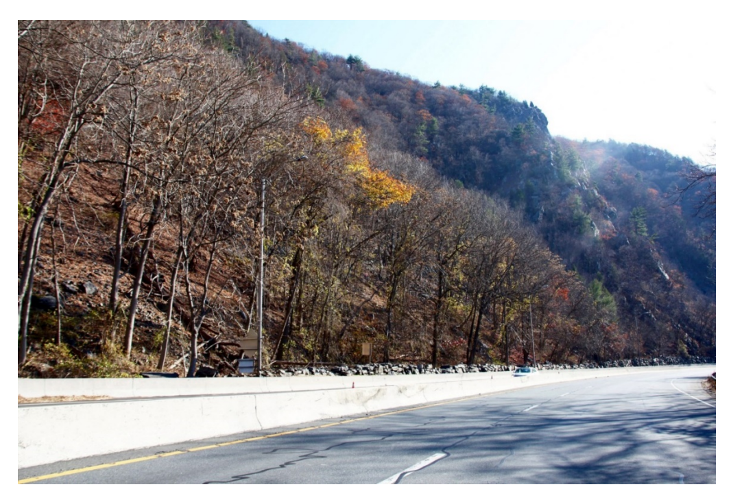
Photograph 1: Area A, looking southeast.