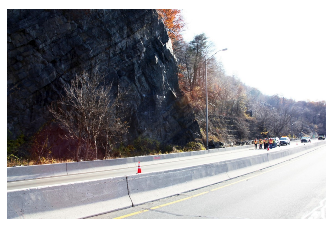
Photograph 3: Areas C and D, looking southeast (note existing gabion wall).