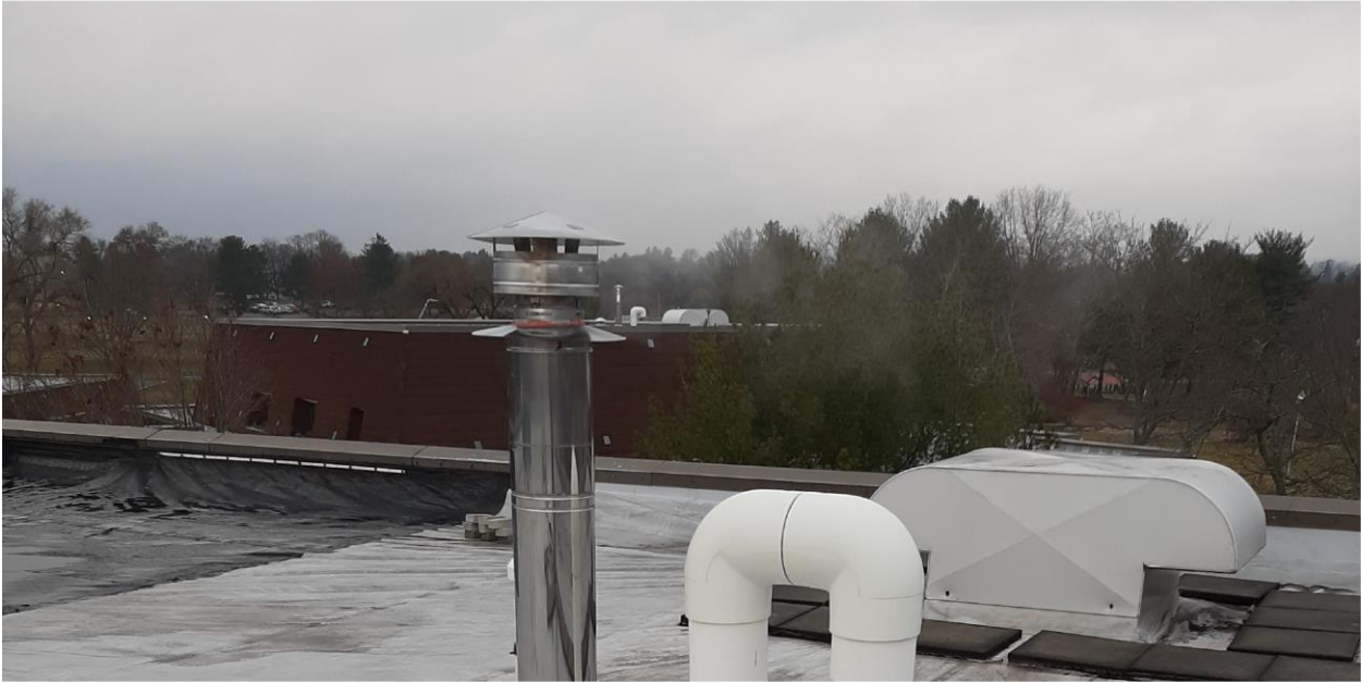
Cottage 14-Upper Roof