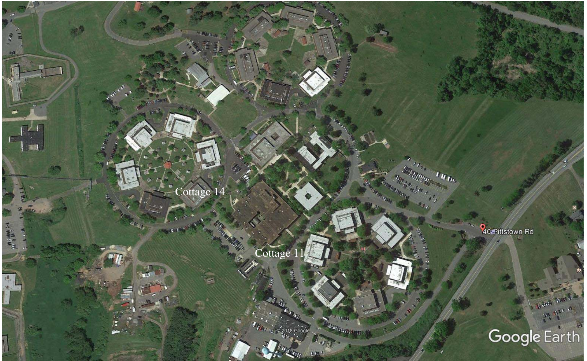
EXHIBIT 'E' HUNTERDON DEVELOPMENTAL CENTER