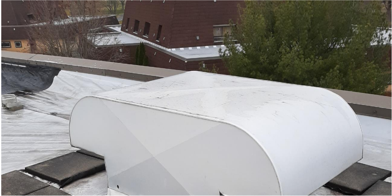
Cottage 14-Upper Roof