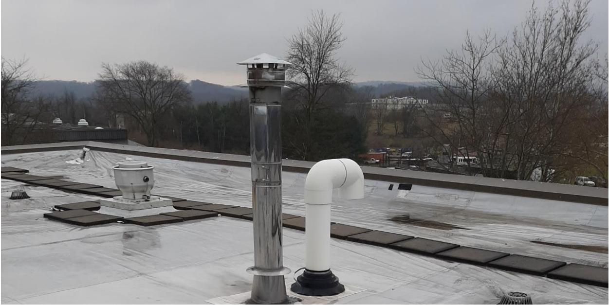
Cottage 11-Upper Roof