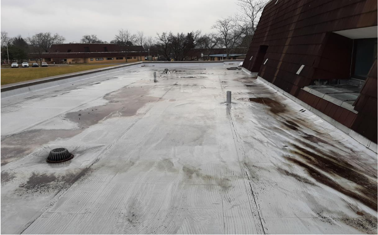
Cottage 14- Lower Roof