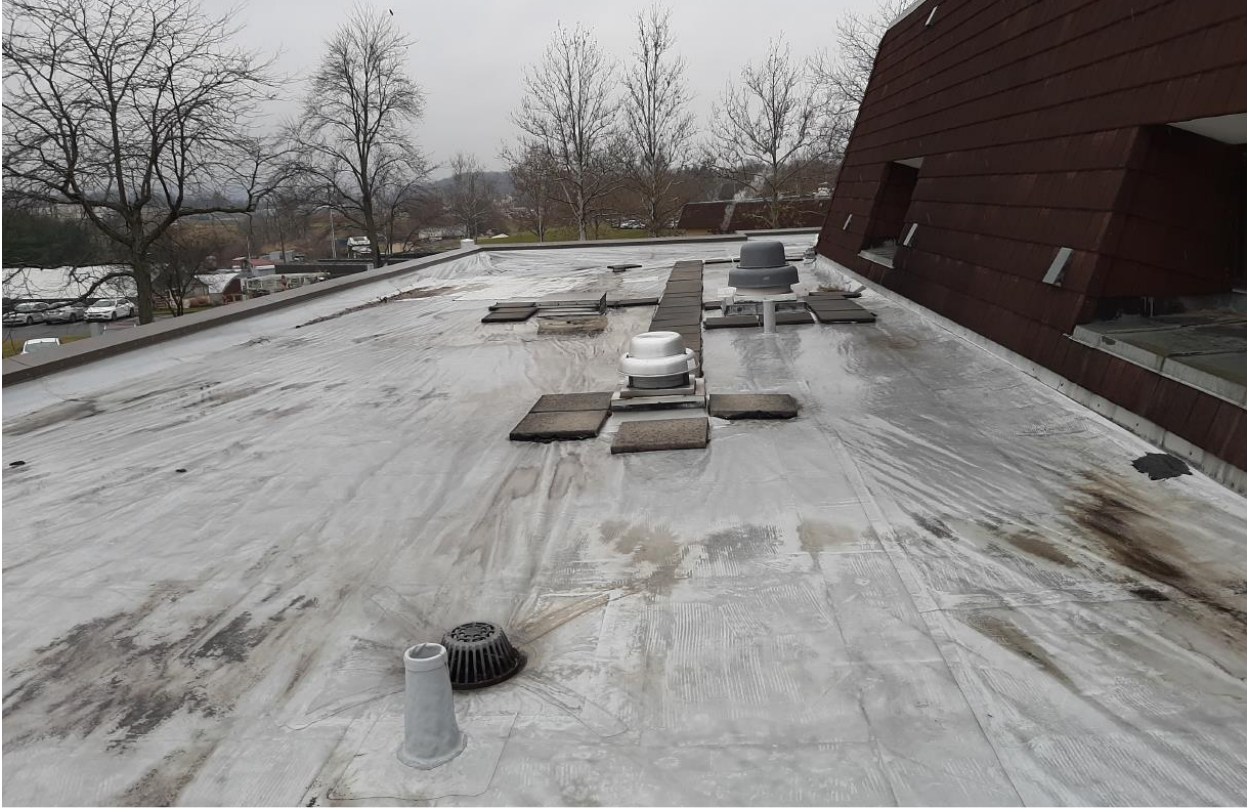
Cottage 11 –Lower Roof