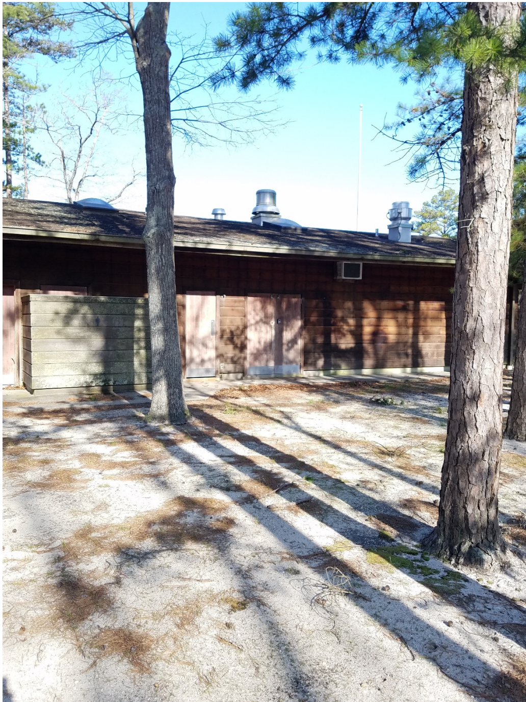
Existing Recreation Complex –Bass River State Forest EXHIBIT ‘C’