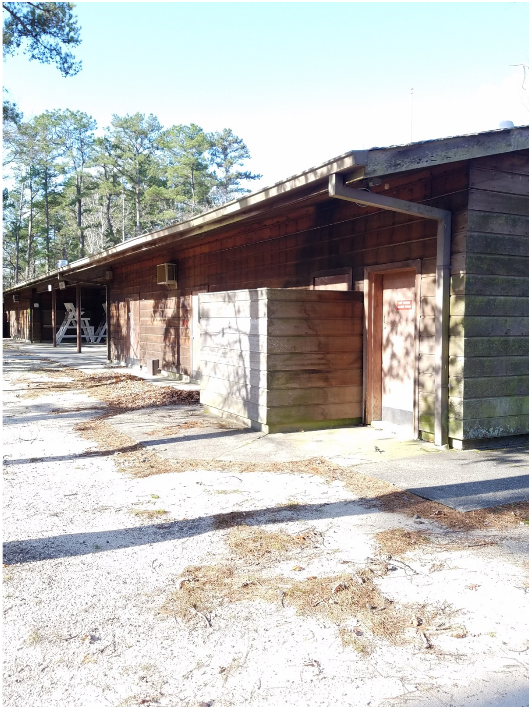
Existing Recreation Complex –Bass River State Forest EXHIBIT ‘C’