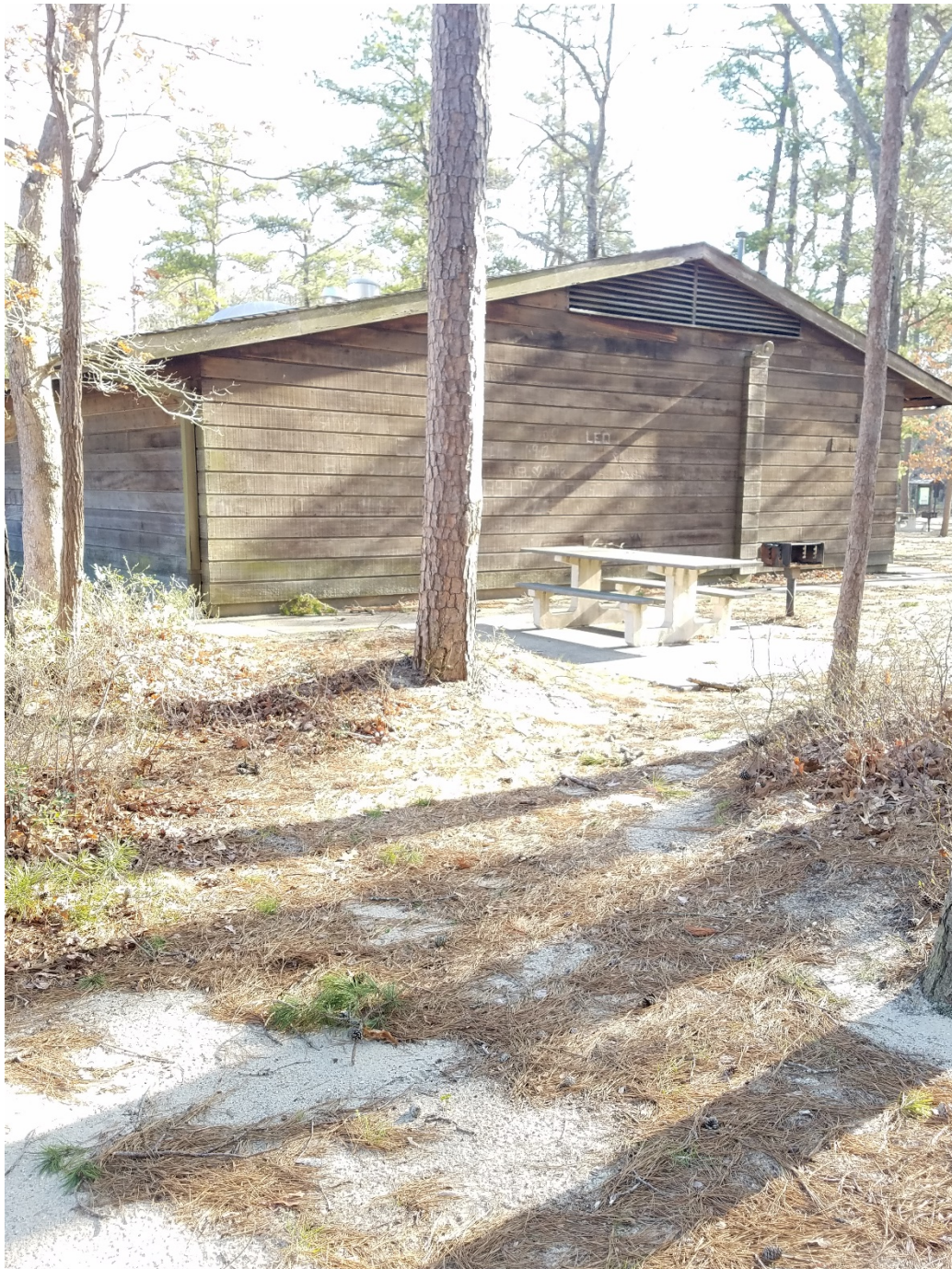
Existing Recreation Complex –Bass River State Forest EXHIBIT ‘C’