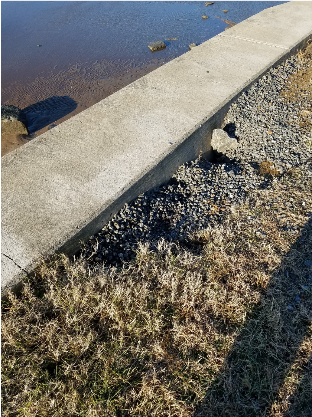
Roadway over Sluice Gate EXHIBIT 'D'