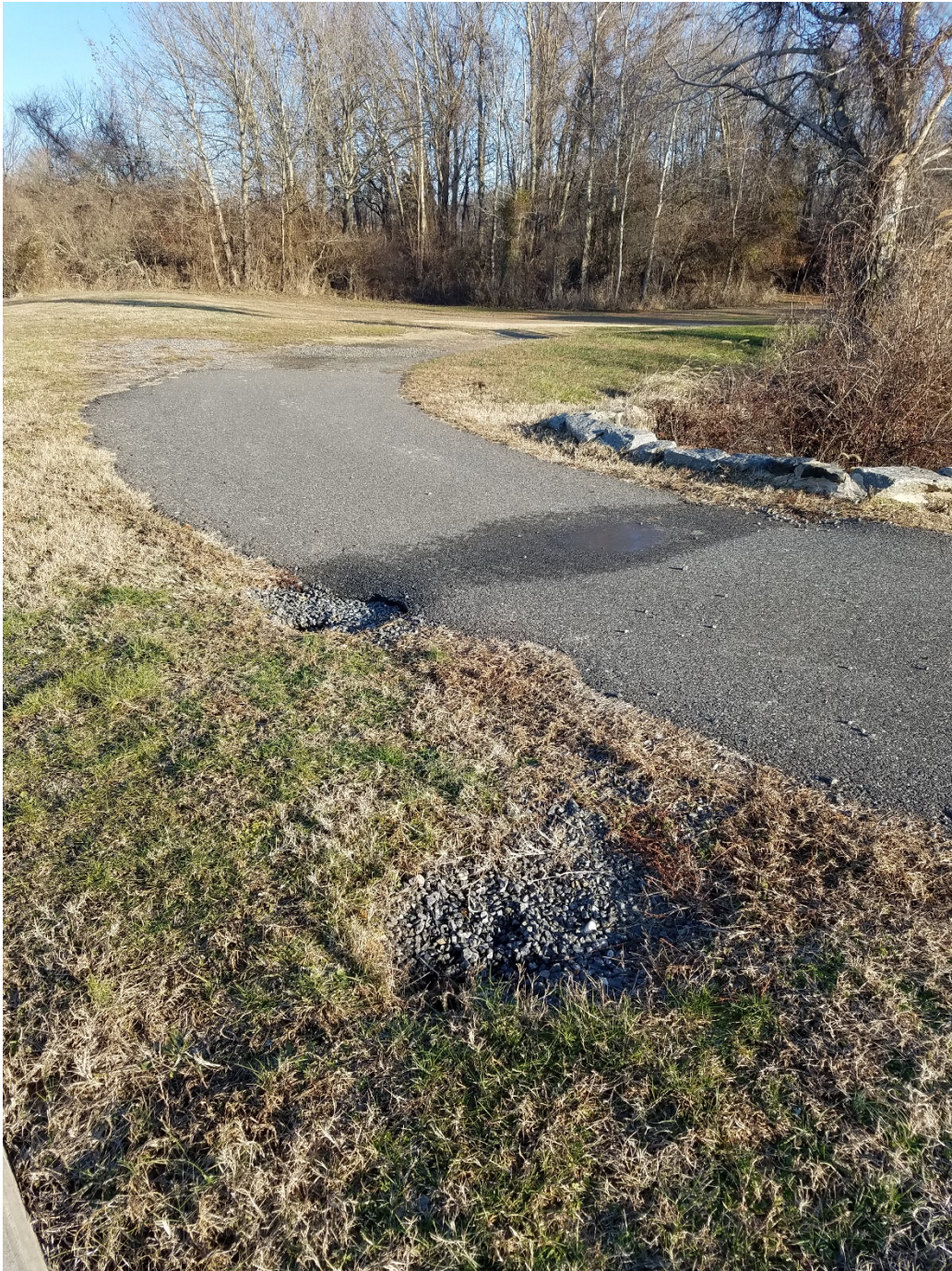
Roadway over Sluice Gate EXHIBIT 'D'