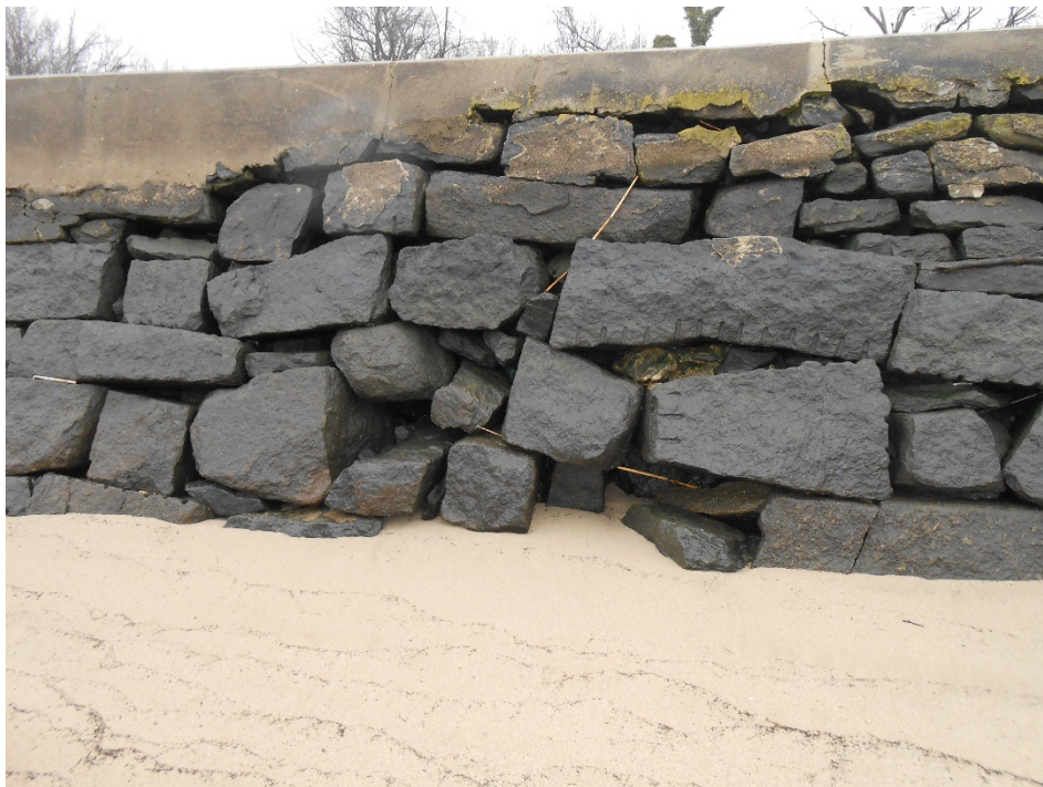
Seawall at Fort Mott EXHIBIT 'D'