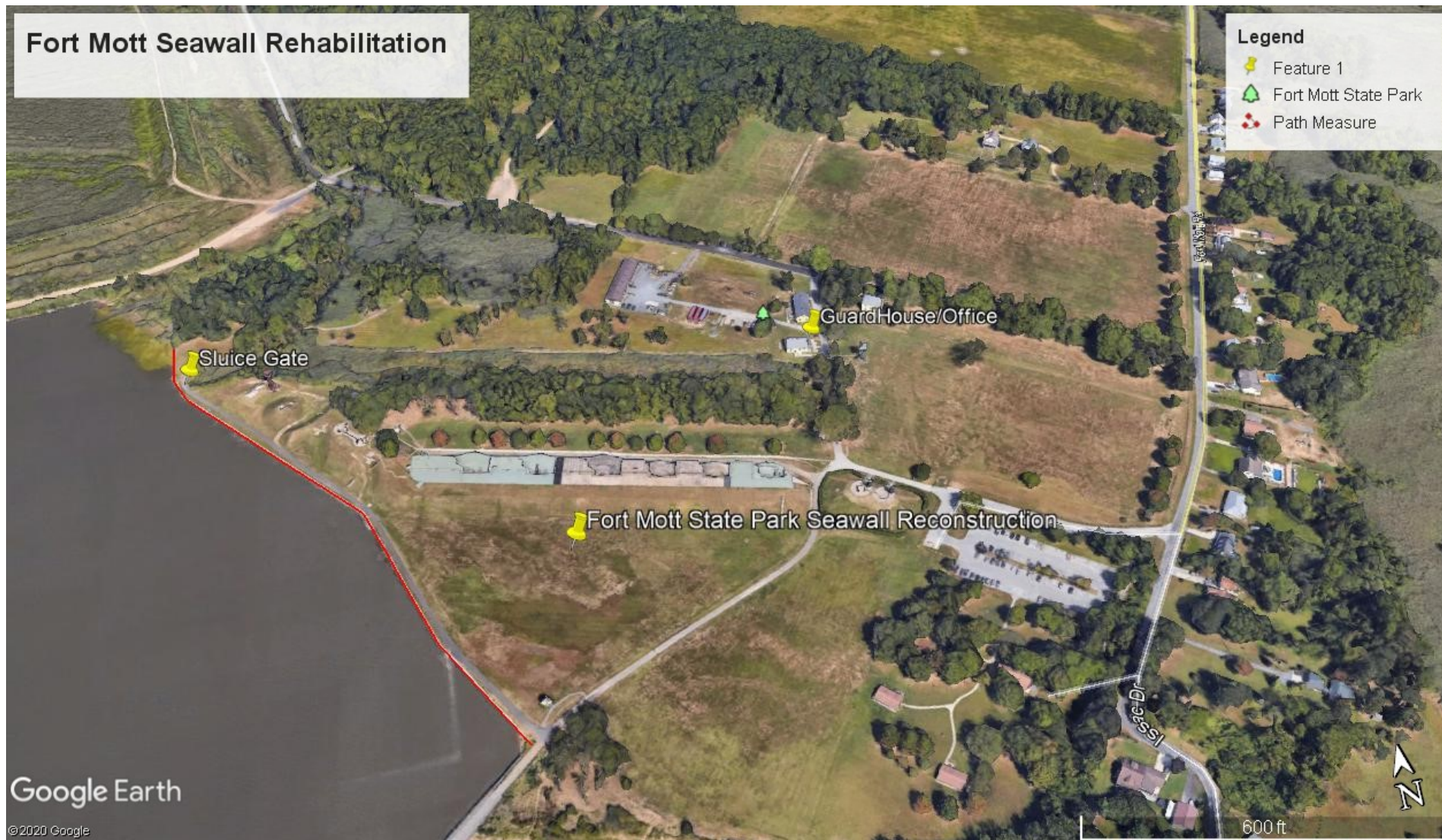
Project Site Map Fort Mott State Park EXHIBIT 'C'