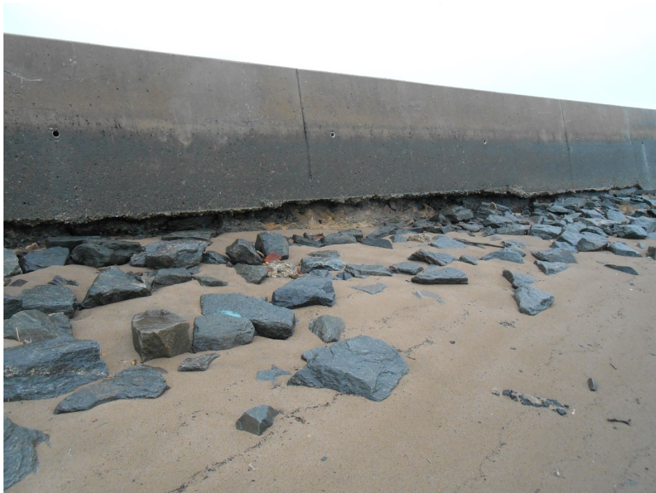
Seawall at Fort Mott EXHIBIT 'D'