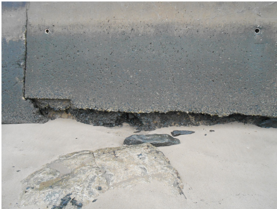
Seawall at Fort Mott EXHIBIT 'D'