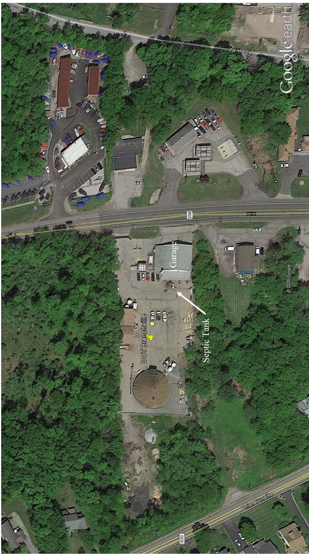
Site Map DOT Branchville Maintenance Yard EXHIBIT 'C'