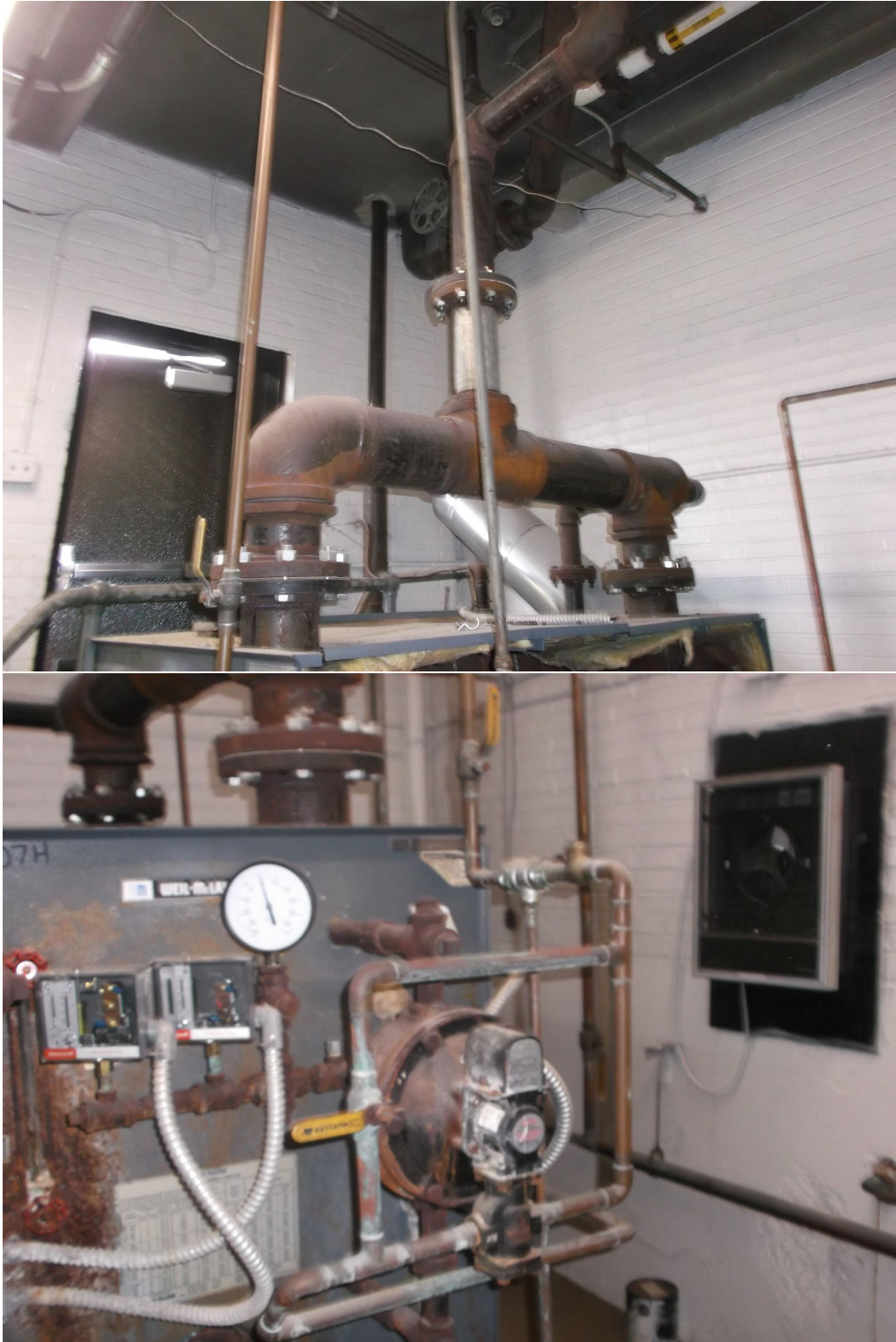
EXHIBIT 'D' STEAM HEADER / BOILER PIPING