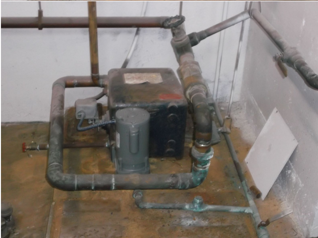
EXHIBIT 'D' CONDENSATE PUMP & PIPING