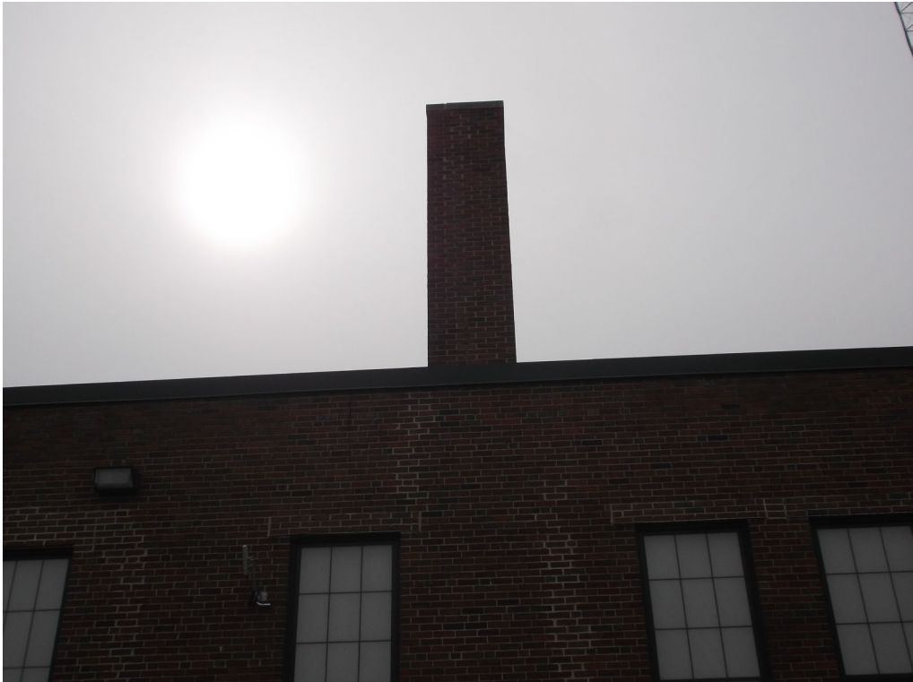
EXHIBIT 'D' FLUE PIPING / EXISTING CHIMNEY