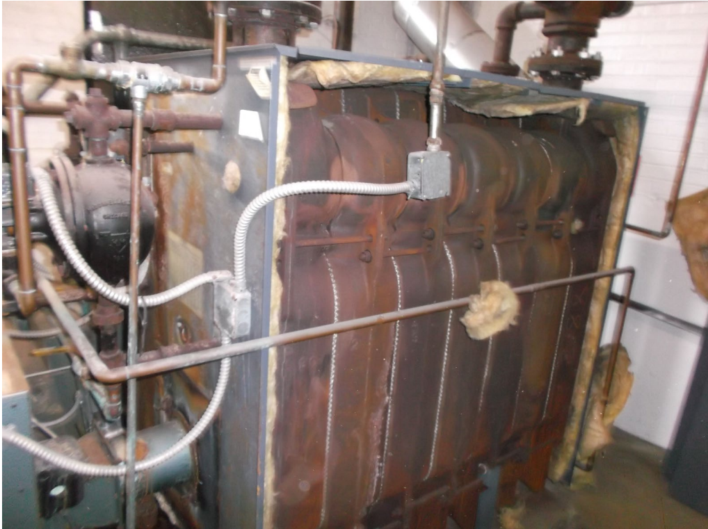
EXHIBIT 'D' EXISTING BOILER