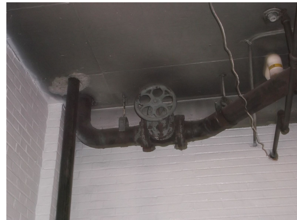
EXHIBIT D' STEAM PIPING / STEAM VALVE