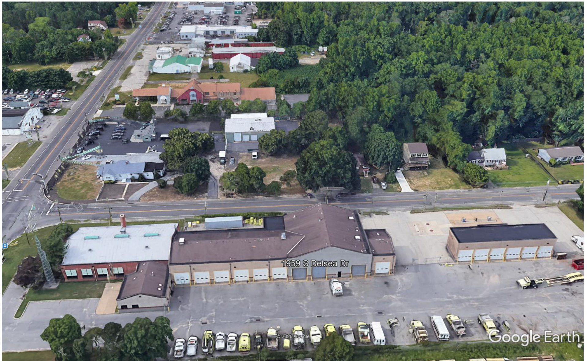
EXHIBIT 'C' VINELAND MAINTENANCE YARD