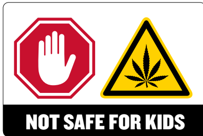
PACKAGING & LABELING