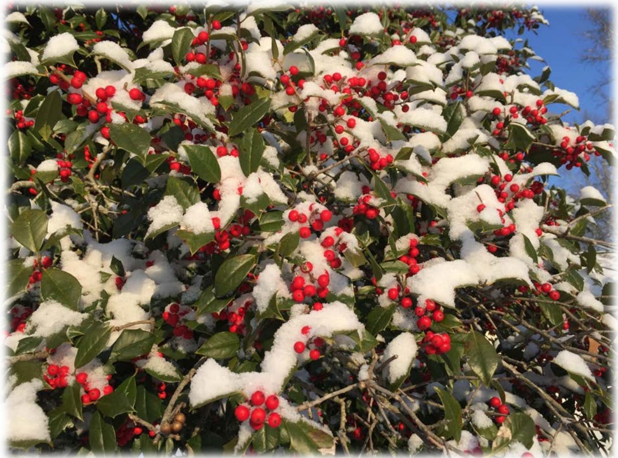
American holly tree covered in snow