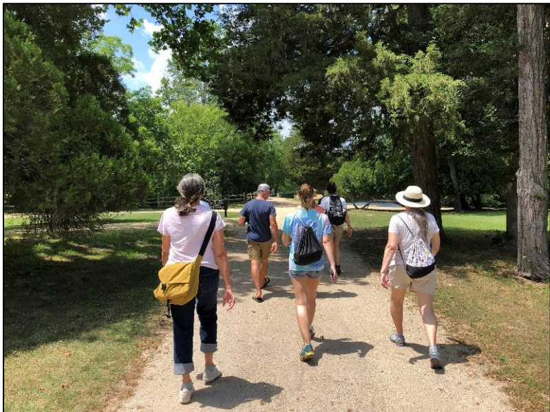
Above: Approximately 75 people attended the Pinelands Summer Short Course, which featured a guided hike at Batsto Village.