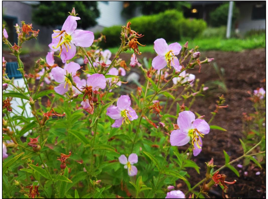
Above: Native Virginia meadow beauty ( Rhexia virginica ) plants have been blooming in the Commission's rain garden for more than a month.