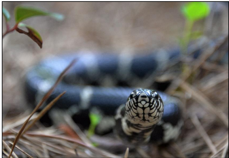
Above: A king snake that spends much of its time in upland habitats. This snake was captured when it ate a corn snake that was being radio tracked.