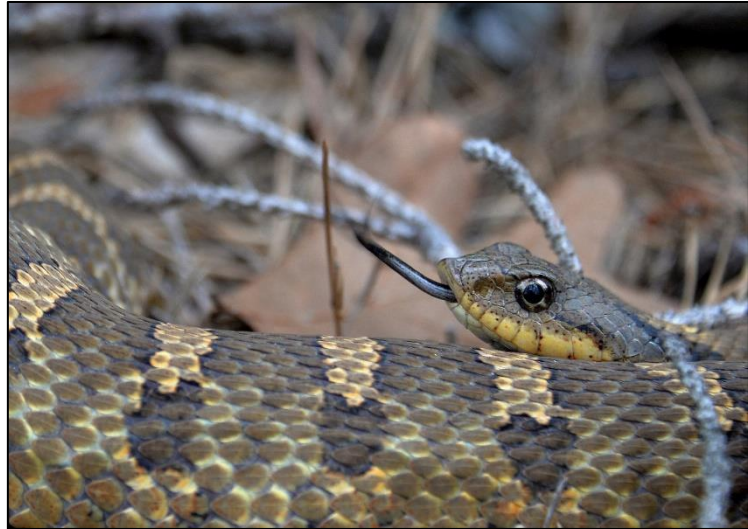
Above: Female eastern hognose being radio tracked to find her den as part of the Long-term Rare Snake Monitoring Project.

Science staff continued to radio track snakes as part of this monitoring program. At the end of July, 20 corn snakes, 10 pine snakes, and 2 hognose snakes were being tracked. The primary goal is to locate nesting areas, shedding areas, and the winter hibernacula for each snake. Twenty corn snakes, 3 king snakes, 1 pine snake, and 1 hognose laid eggs in captivity, and the eggs are being incubated in the lab. Most of the female corn snakes and the hognose have been implanted with radio transmitters and are being tracked to locate their winter dens. The hatchlings will be pit tagged and released for future population monitoring.