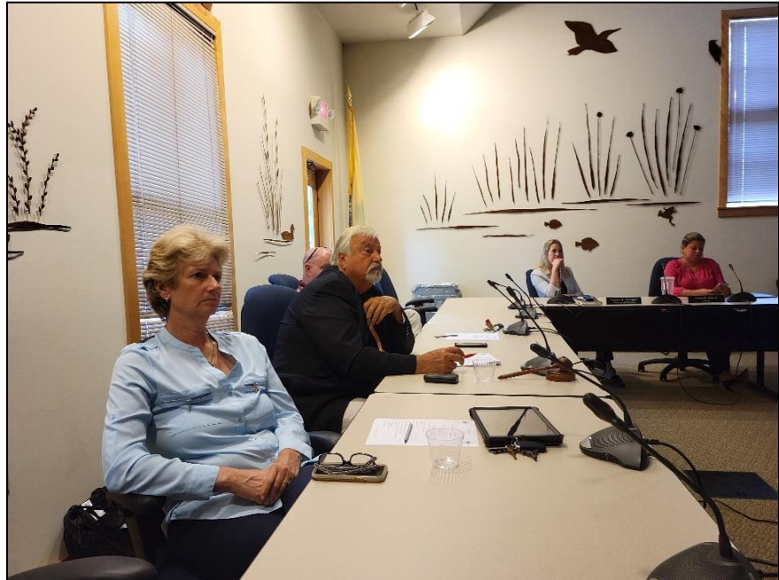
Above: The Pinelands Municipal Council met at the Pinelands Commission's headquarters on July 26, 2022.