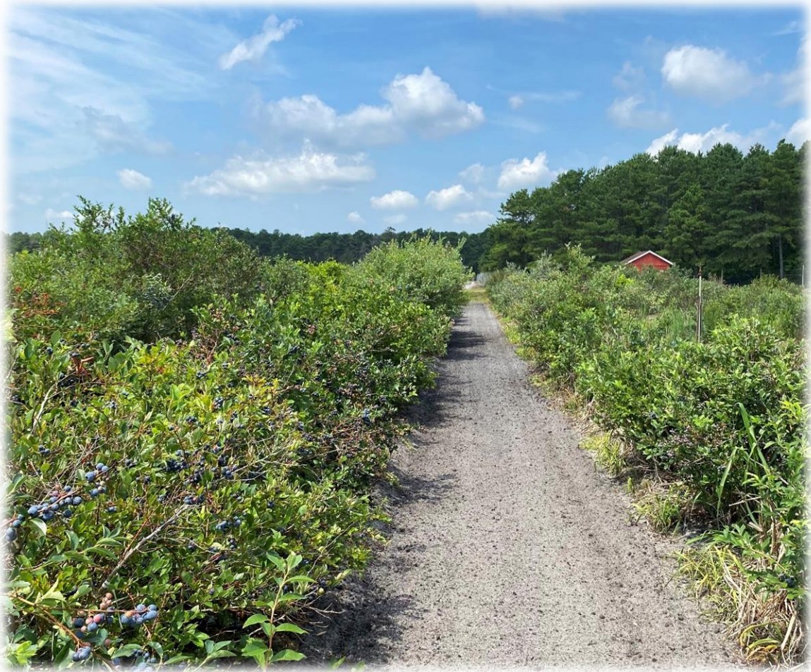
A tour of the blueberry fields at the Philip E. Marucci Center for Blueberry and Cranberry Research and Extension in Chatsworth, NJ, in July