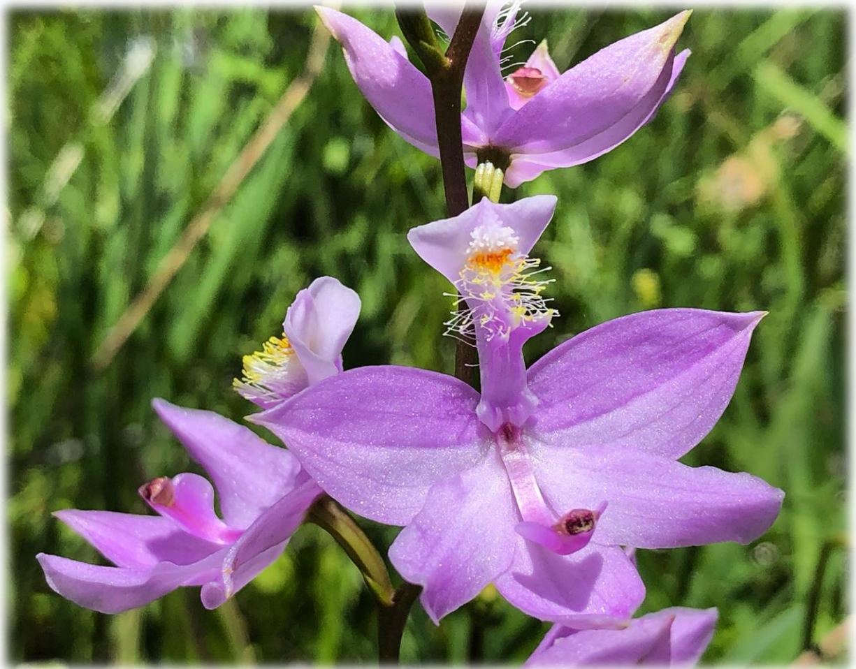
Native grass pink orchids blooming in June