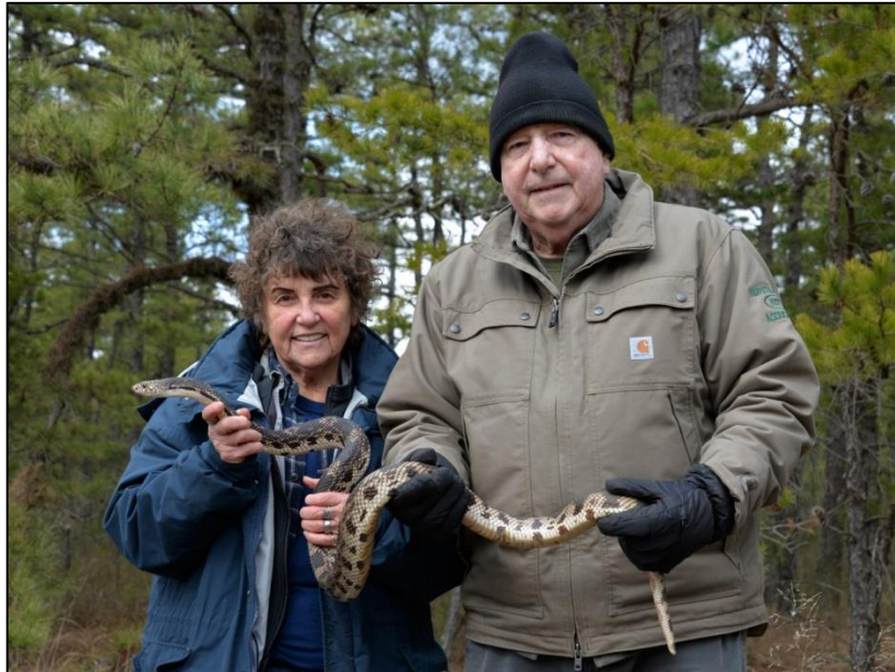
Above: Rutgers University and Herpetological Associates researchers holding a 25 year old pine snake from one of their study dens. This is the oldest wild pine snake ever documented.