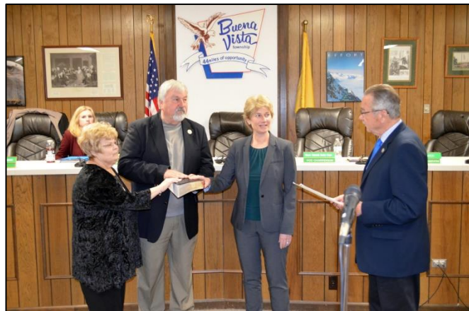
Above: Members of the Pinelands Municipal Council's Executive Committee were sworn in to a new term during the Council's March 10, 2020 meeting.