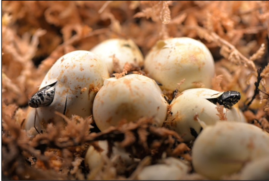
Above: A clutch of eastern kingsnakes hatching. Hatchlings were weighed, measured, tagged for permanent identification, and released back at long-term study sites.