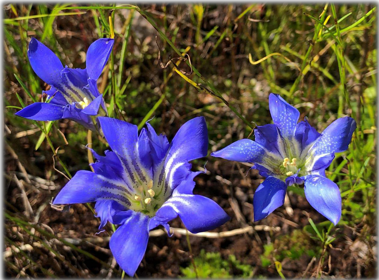
Pine Barrens gentians blooming in September