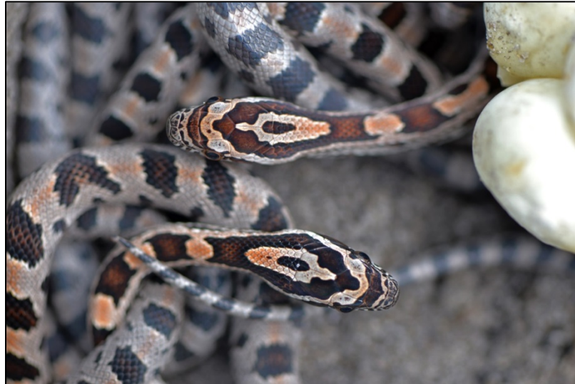
Above: Corn snake hatchlings from a nest area located in a long-term study area.

winter dens will allow all snakes that emerge from hibernation to be evaluated at the beginning of the growing season. Monitoring shed stations will allow researchers to find new snakes from unknown dens in the vicinity. Finding hatchlings at nest areas will allow researchers to monitor their long-term growth, health, and survivorship. In September, staff scientists found several new and previously captured corn snakes, kingsnakes, and pine snakes. Multiple clutches of corn snake, kingsnake, and pine snake hatchlings were also tagged at study sites.