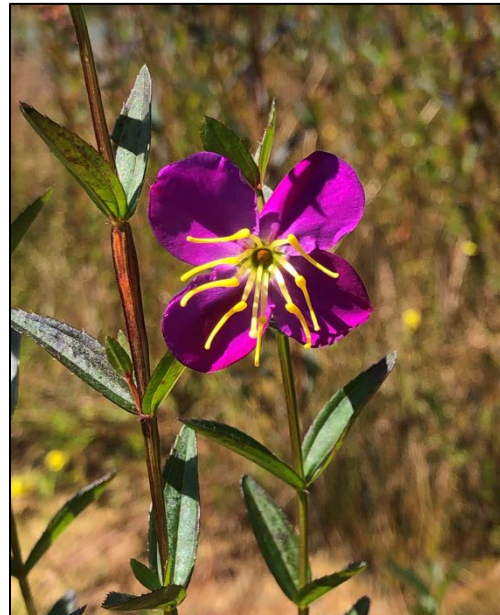
Above: In September 2020, staff members posted 137 photographs on the Commission’s Facebook page, including this one of a native meadow beauty blooming at the Winslow Wildlife Management Area in Camden and Gloucester counties.