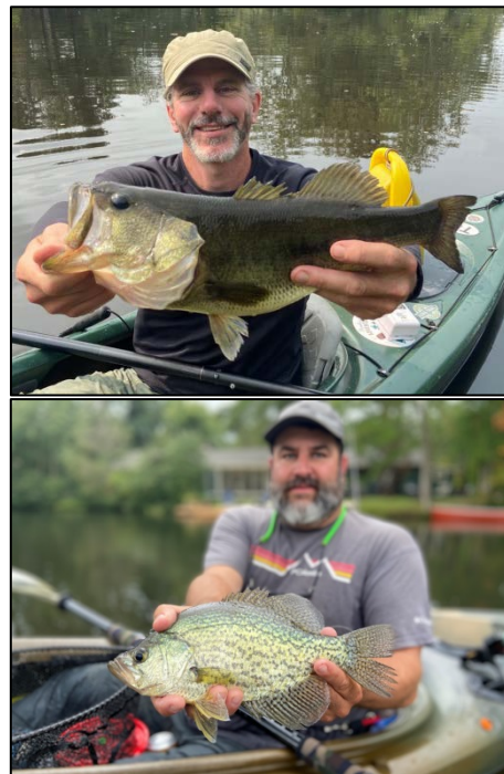
Above: Commission staff members with a largemouth bass (top) and a black crappie (bottom). These two fish species were targeted during the September sampling of lakes above and below the Medford Lakes sewage treatment plant.